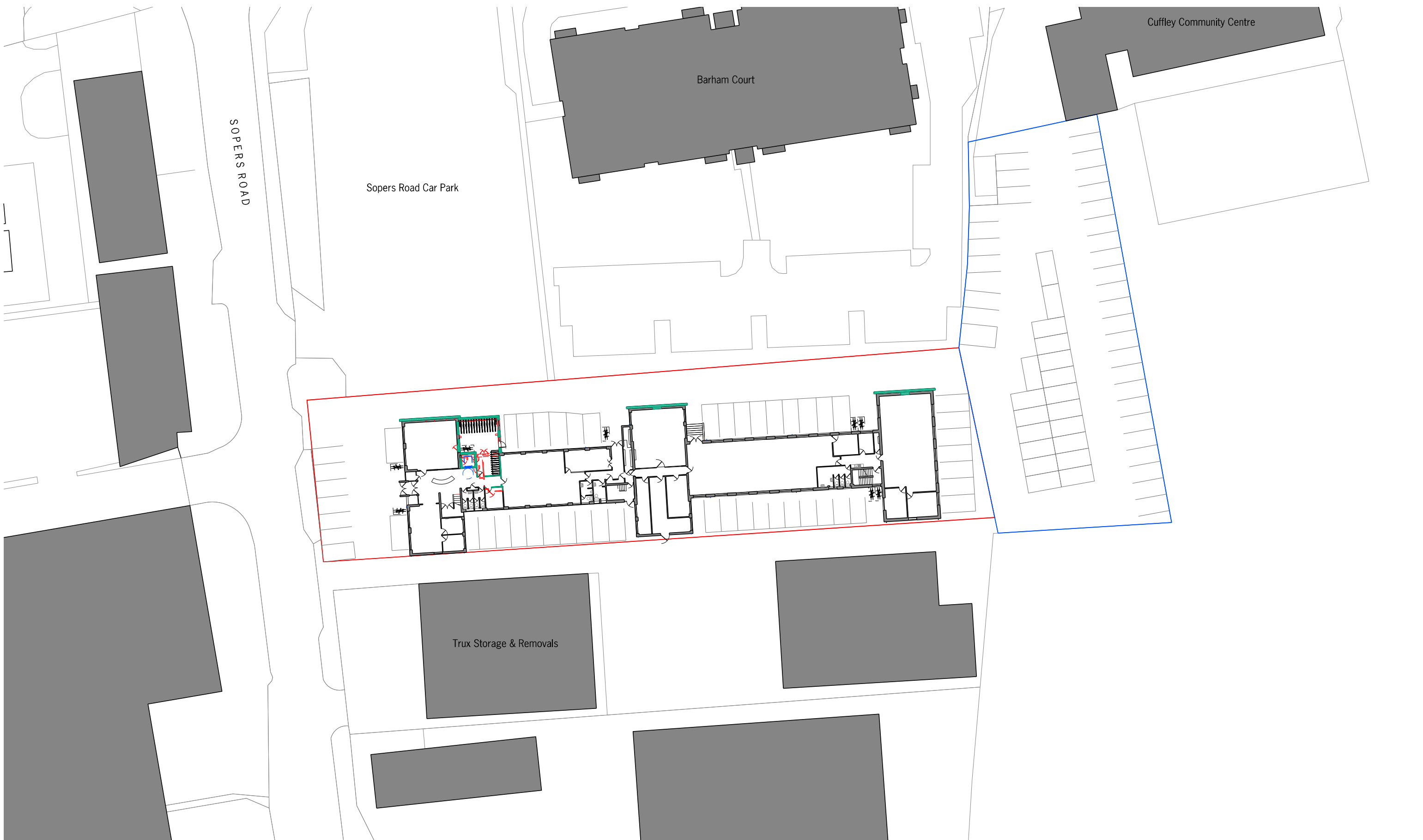
01 Proposed Site Plan 1:500@A3