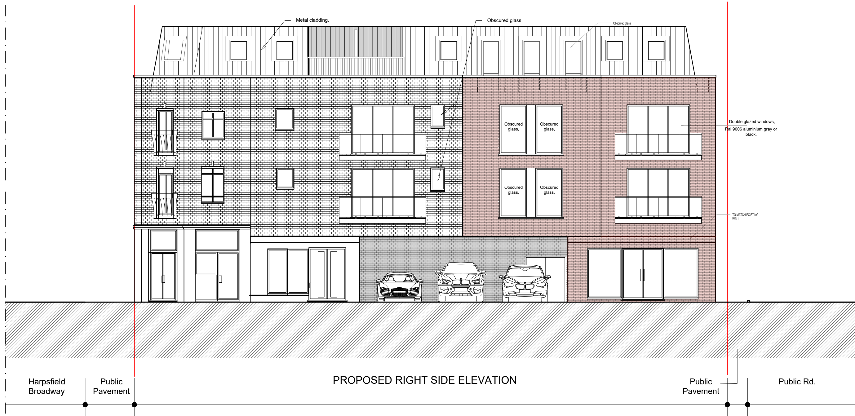
PROPOSED RIGHT SIDE ELEVATION