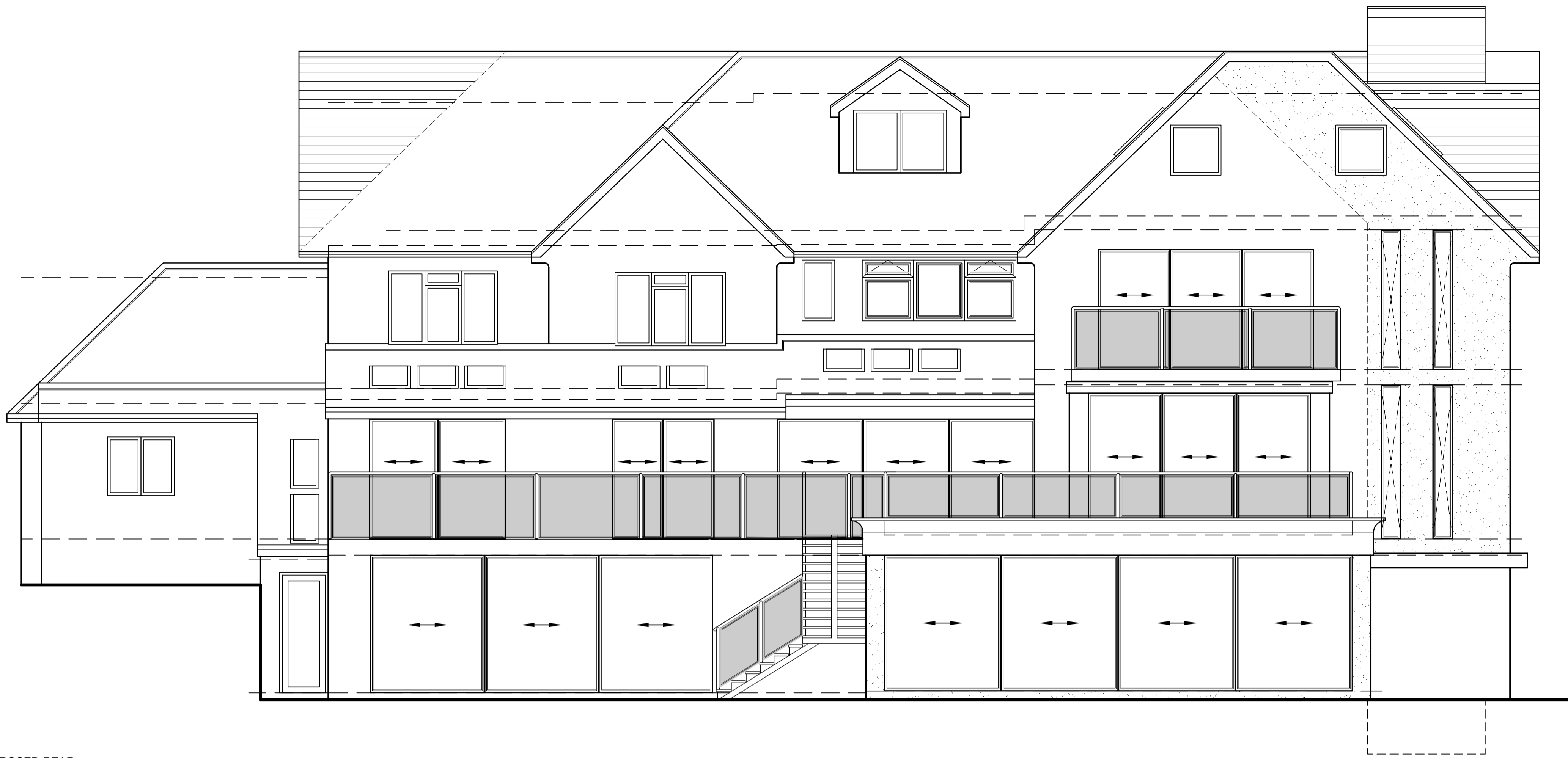
PROPOSED REAR ELEVATION (scale 1:50)