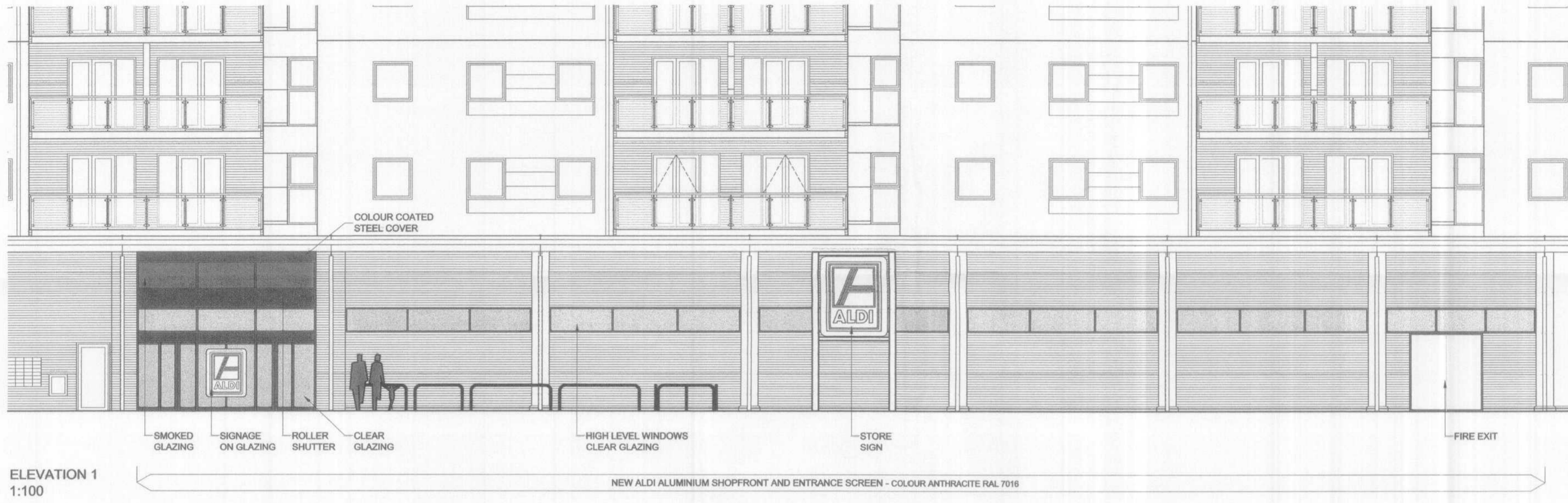
ELEVATION 1 1:100