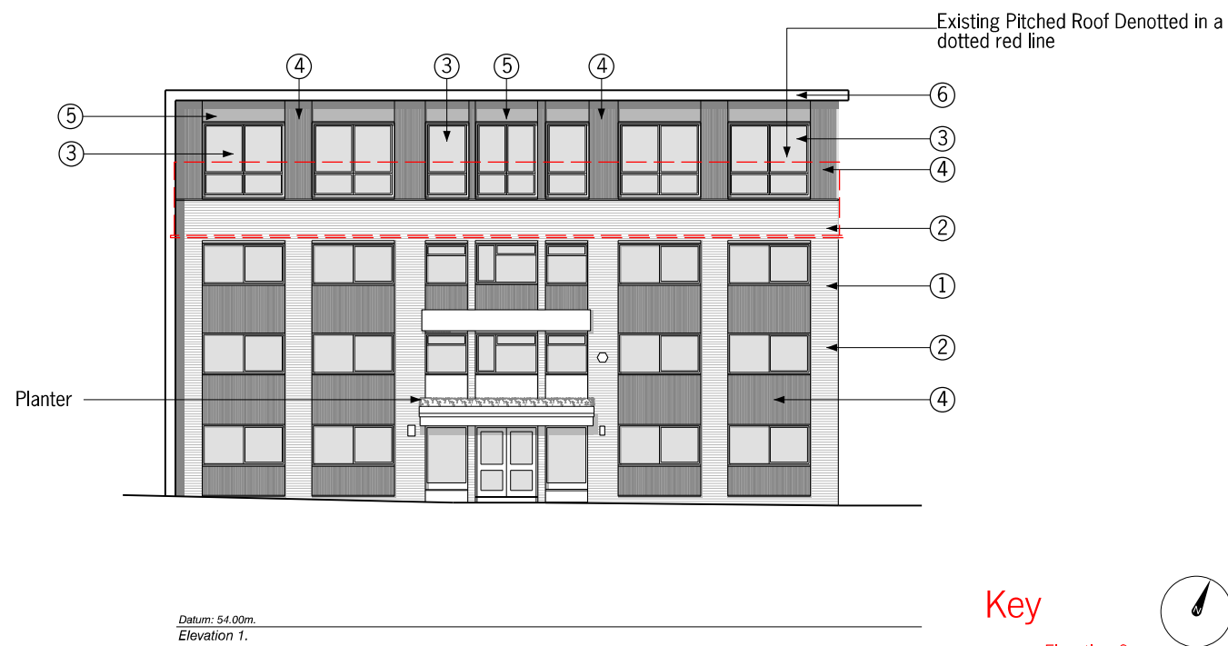
01 Proposed Elevation 1 1:200@A3