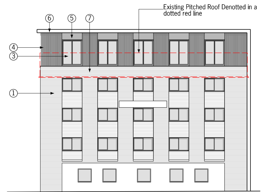
03 Proposed Elevation 3 1:200@A3