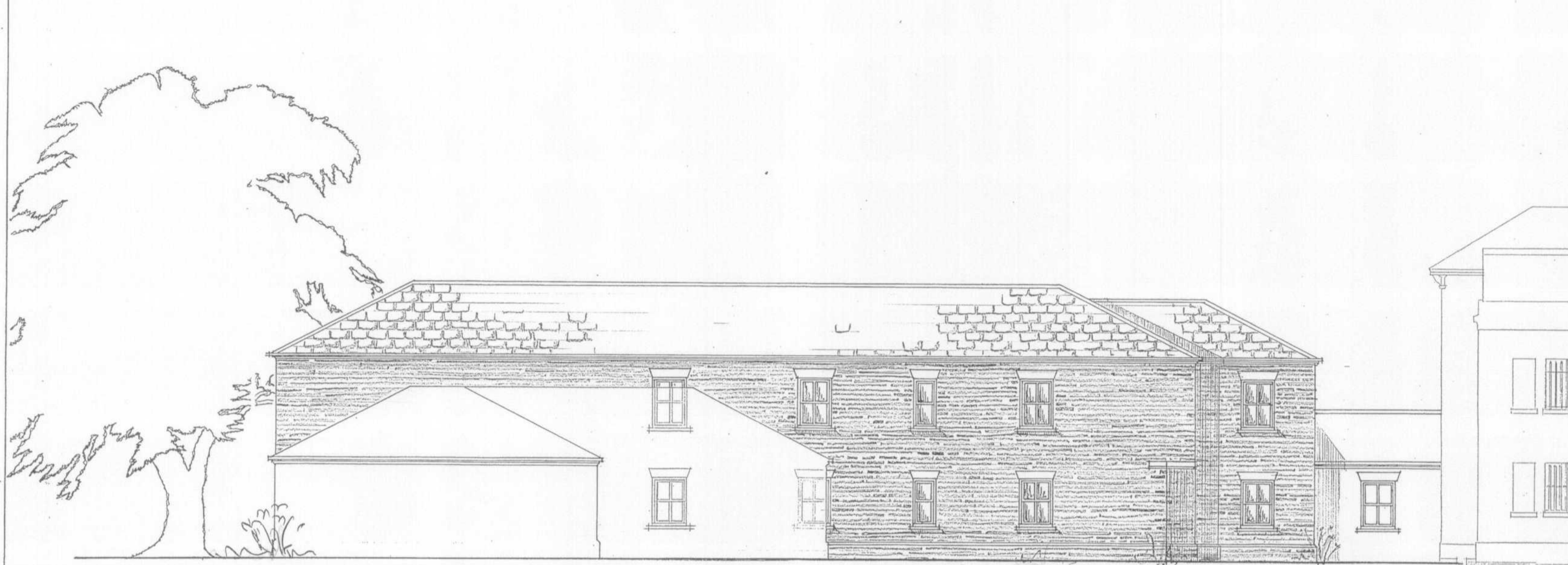
west elevation (courtyard)

Proposed Materials: Roof - Natural Welsh slate Walls - Stock bricks to match existing estate wall Detailing - White limestone (Haddonstone) to plinth, window sills and heads, eaves and copings