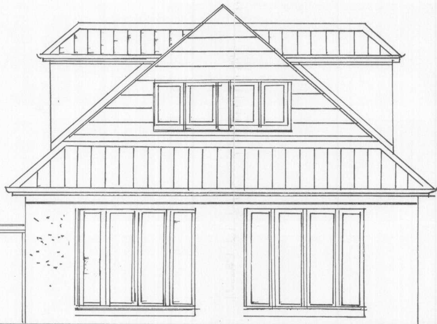
PROPOSED REAR EXTENSION.