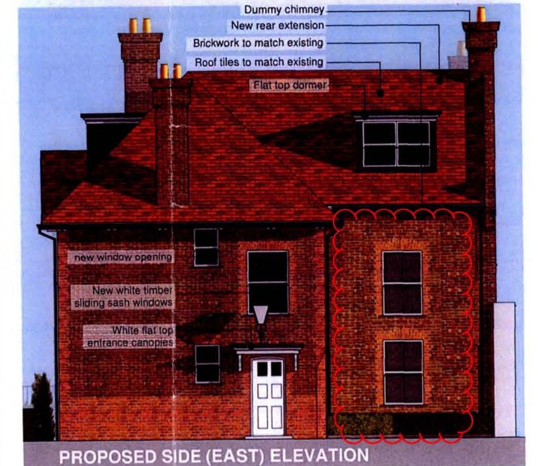
PROPOSED SIDE (EAST) ELEVATION