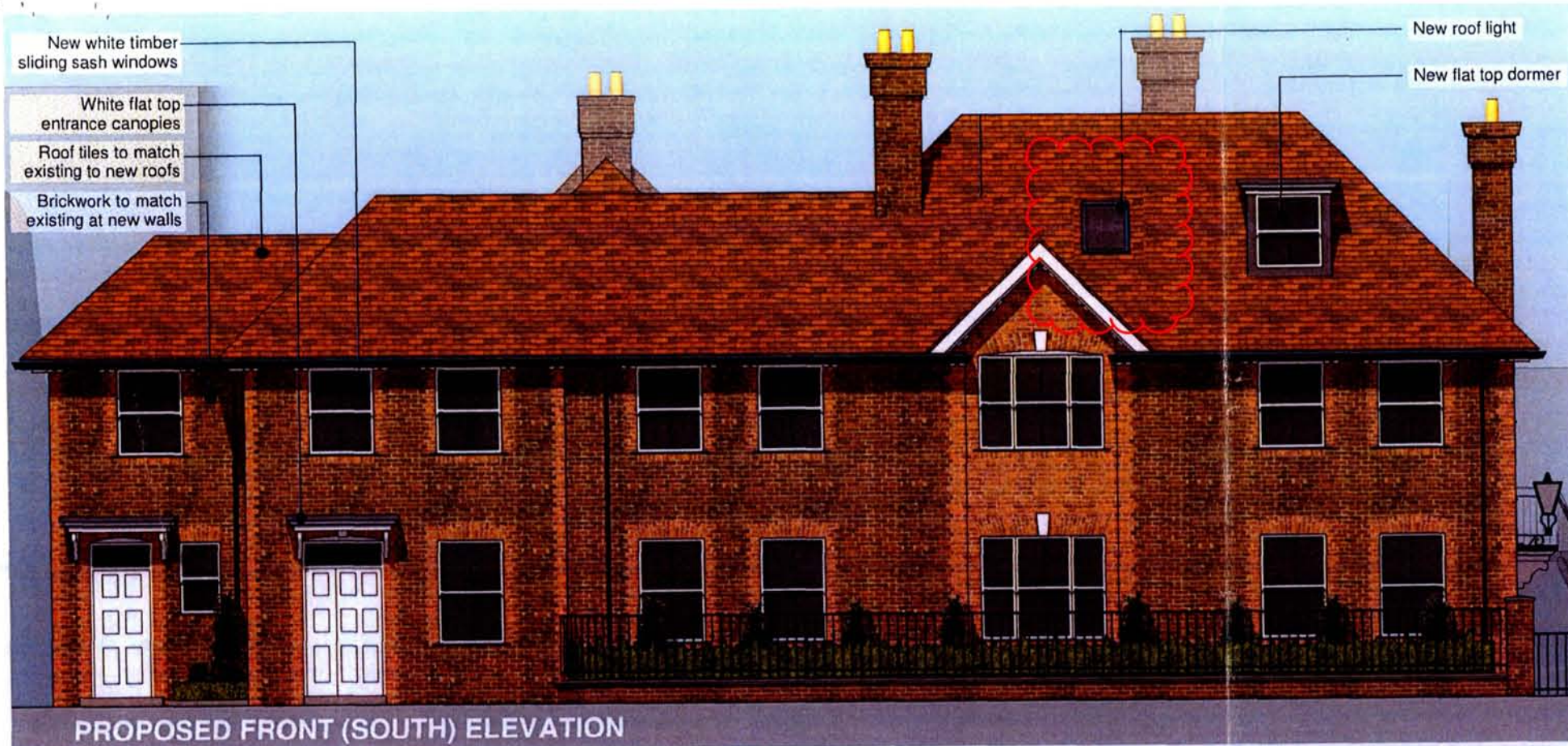
PROPOSED FRONT (SOUTH) ELEVATION