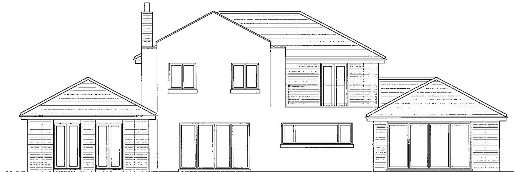
PROPOSED GARDEN ELEVATION 1:100