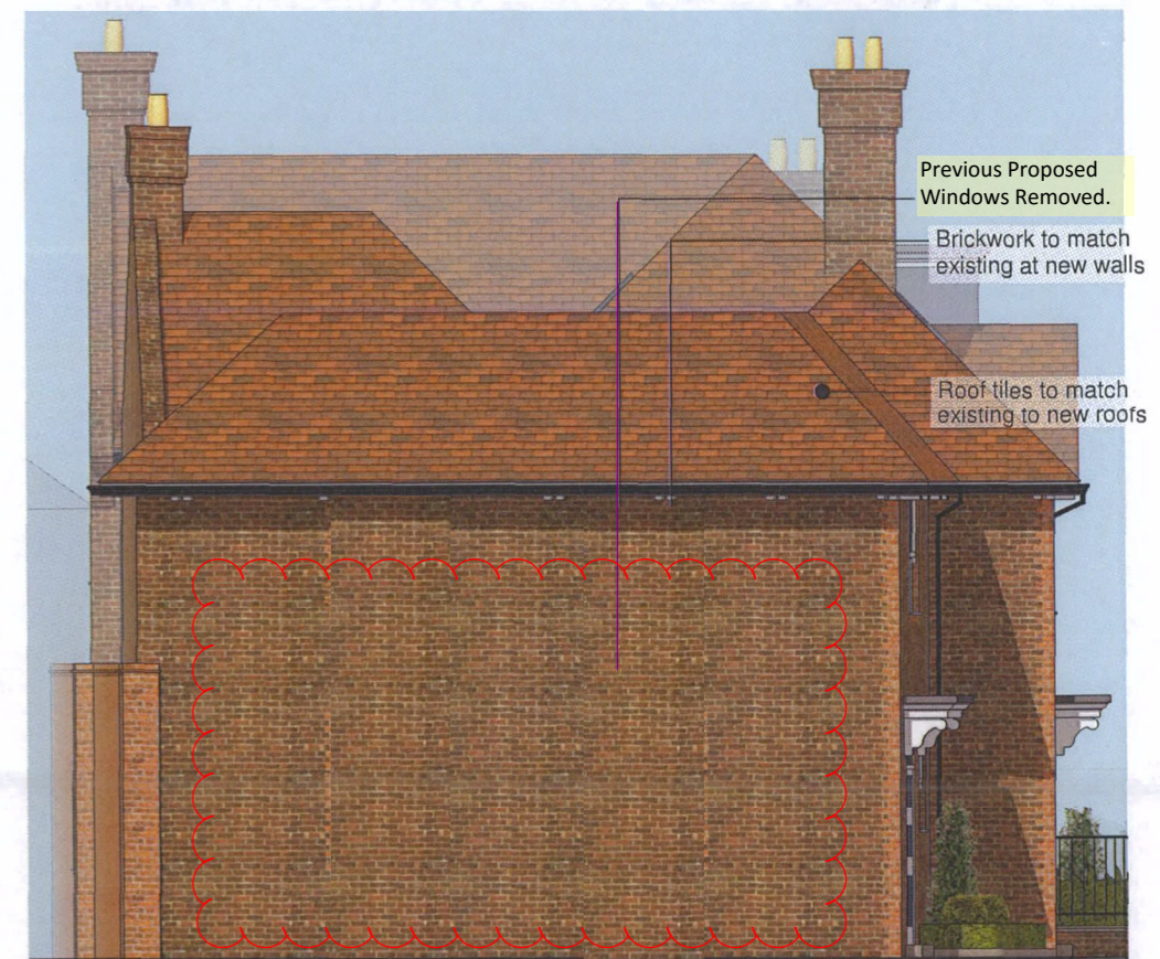
PROPOSED SIDE (WEST) ELEVATION