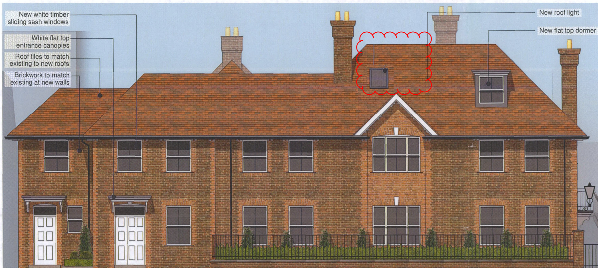
PROPOSED FRONT (SOUTH) ELEVATION