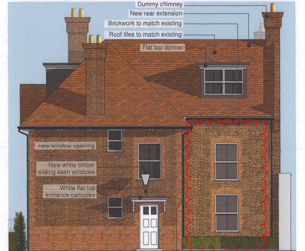
PROPOSED SIDE (EAST) ELEVATION