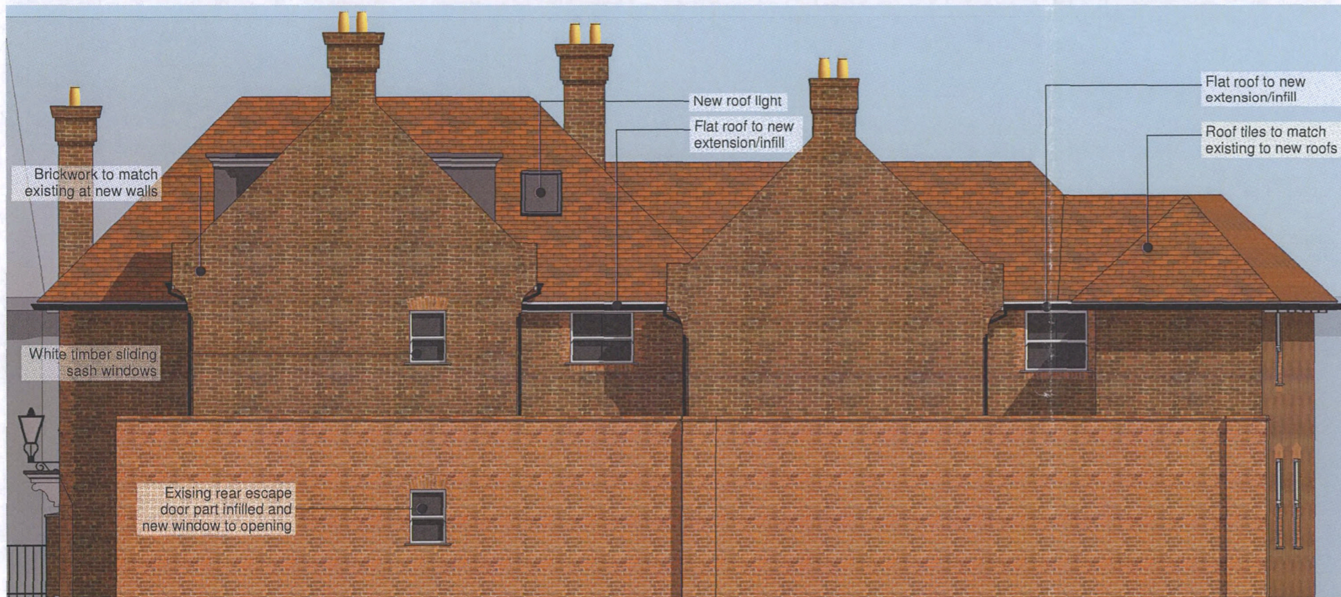
PROPOSED REAR (NORTH) ELEVATION