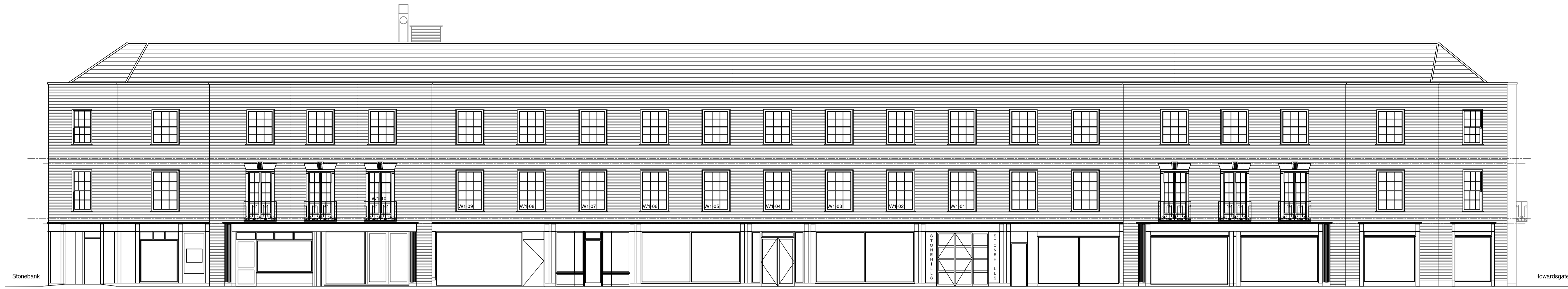
Stonehills West Elevation