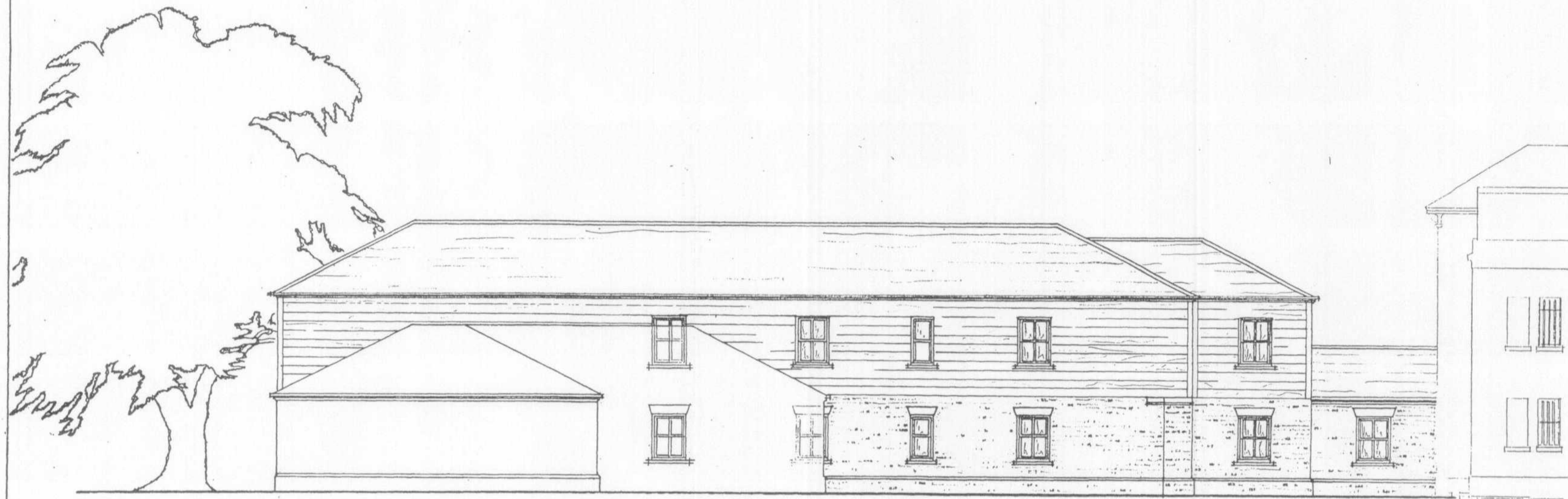
west elevation (courtyard)

Detailing - White limestone (Haddonstone) to plinth, window sills and heads, eaves and copings