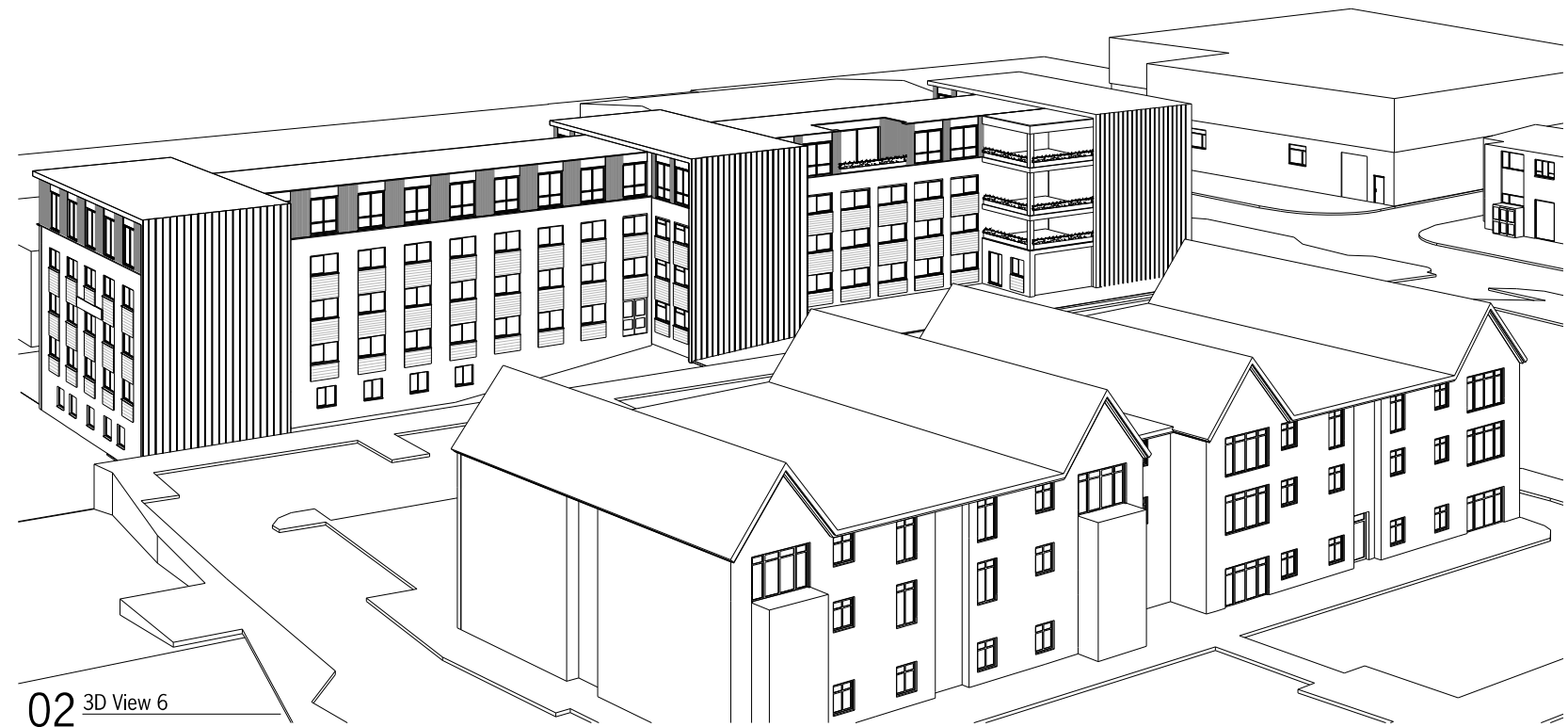
02 3D View 6