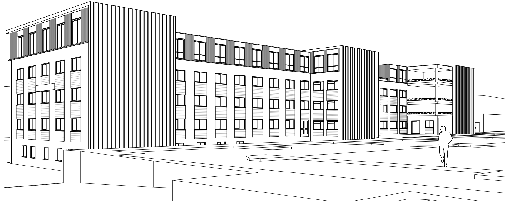
01 3D View 5