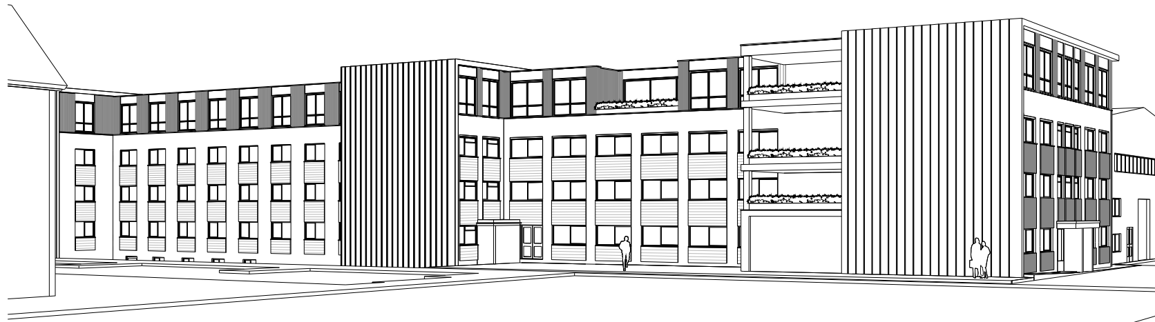
01 3D View 3