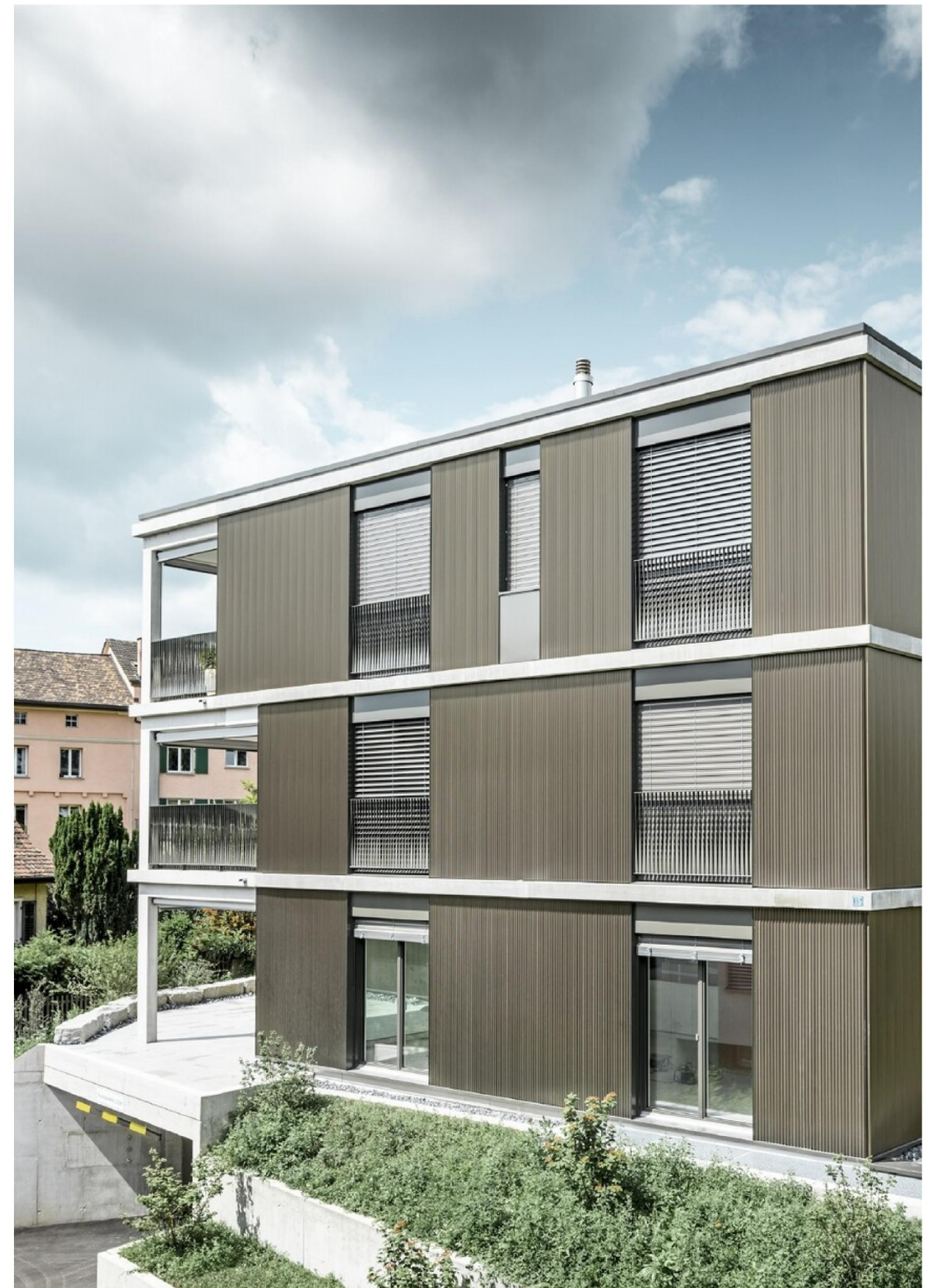
03 Aluminium Extruded Cladding Precedent

All dimensions must be checked and PAPA Architects Ltd are to be informed of any discrepancies prior to construction. Any DWG's issued by PAPA Architects Ltd are to be read in conjunction with the associated PDF versions. This drawing and any of the details therein remain the copyright of PAPA Architects Ltd. All drawings prepared by PAPA Architects are not to be used for any submissions, area schedule calculations or used by any other persons or companies other than PAPA Architects Ltd unless written consent has been given by PAPA Architects Ltd.