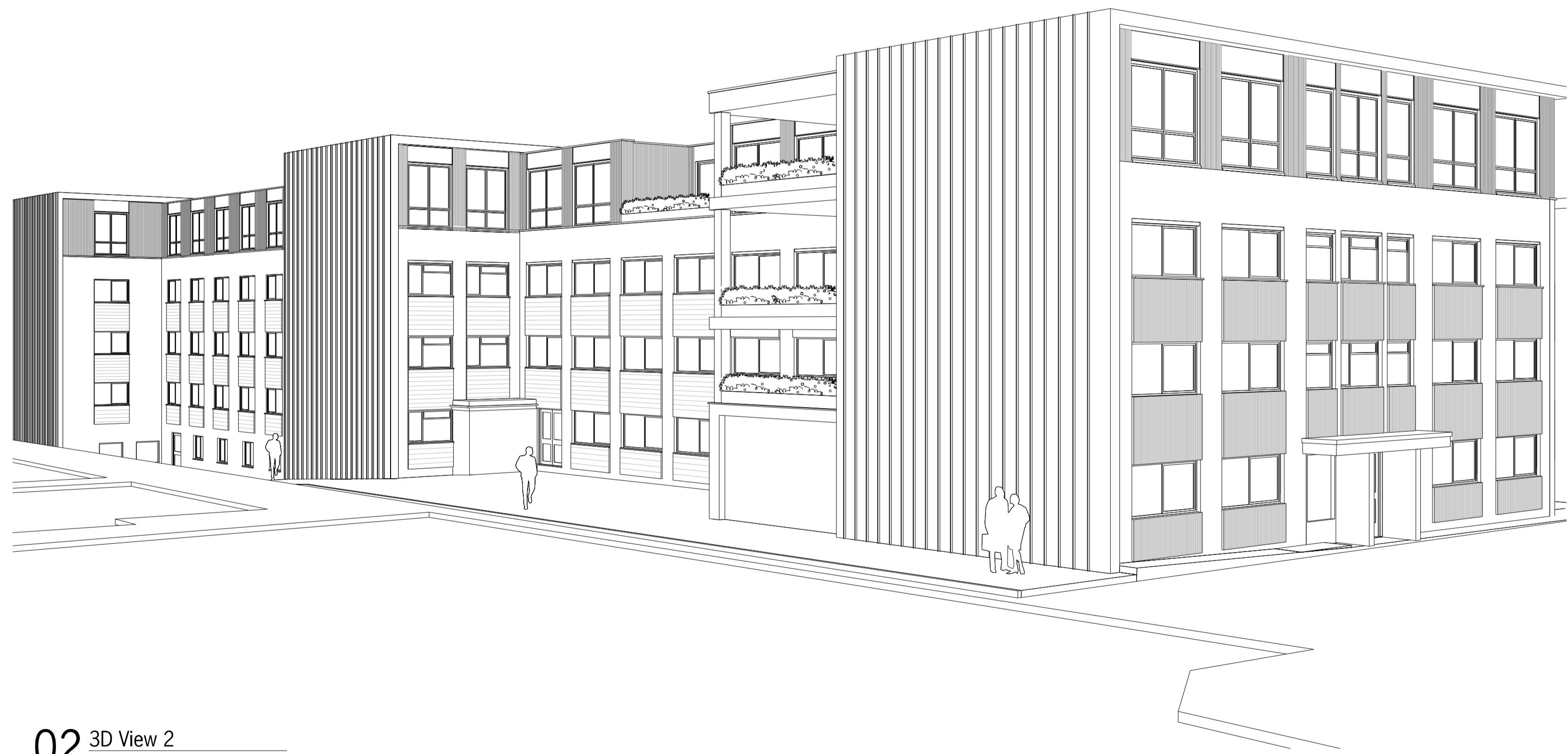
02 3D View 2