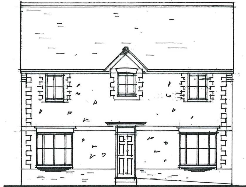
• front elevation •