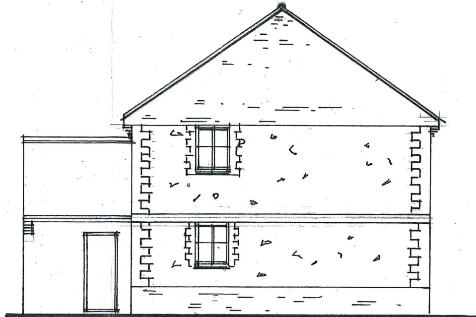
• side elevation •