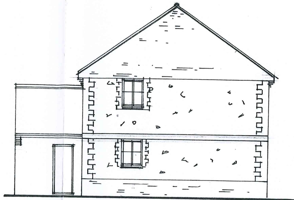
• side elevation •