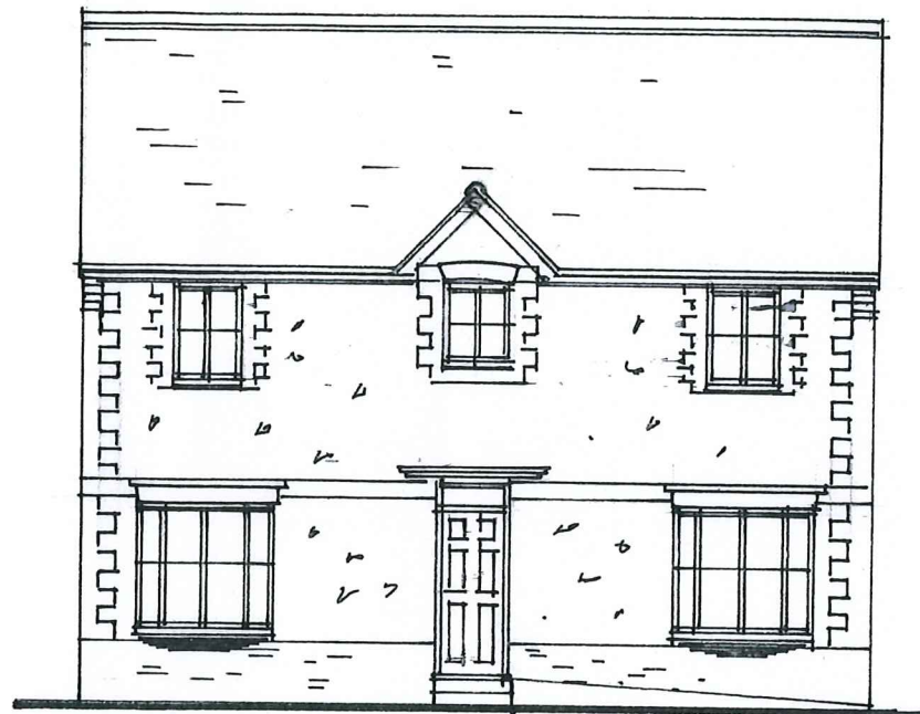
• front elevation •