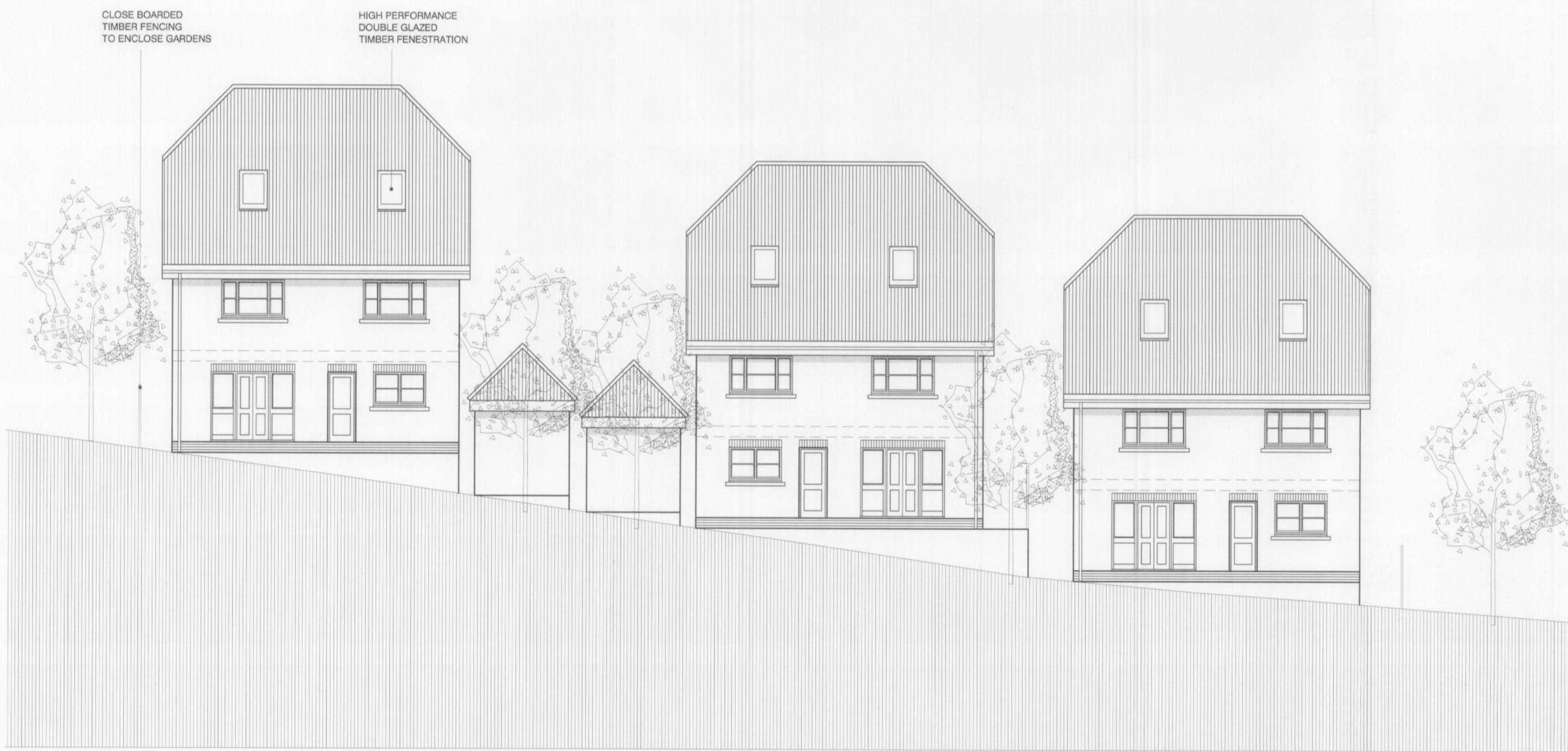
PLOTS 3, 4 & 5 - REAR ELEVATION