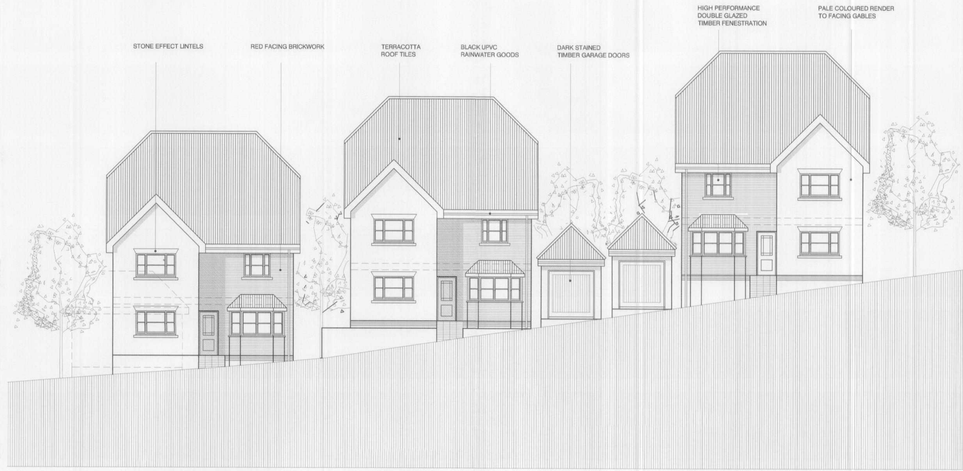
PLOTS 3, 4 AND 5 - FRONT ELEVATION