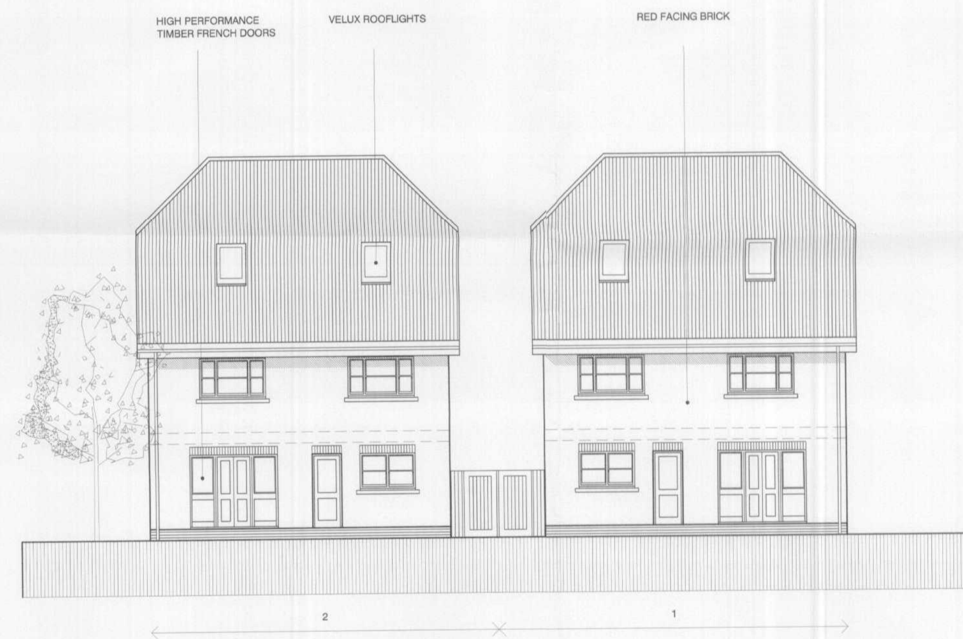
PLOTS 1 AND 2 - REAR ELEVATIONS