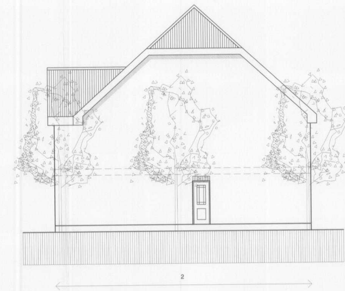
PLOT 2 - SIDE ELEVATION