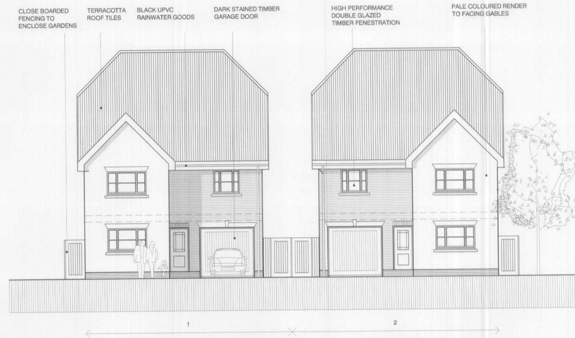
PLOTS 1 AND 2 - FRONT ELEVATION