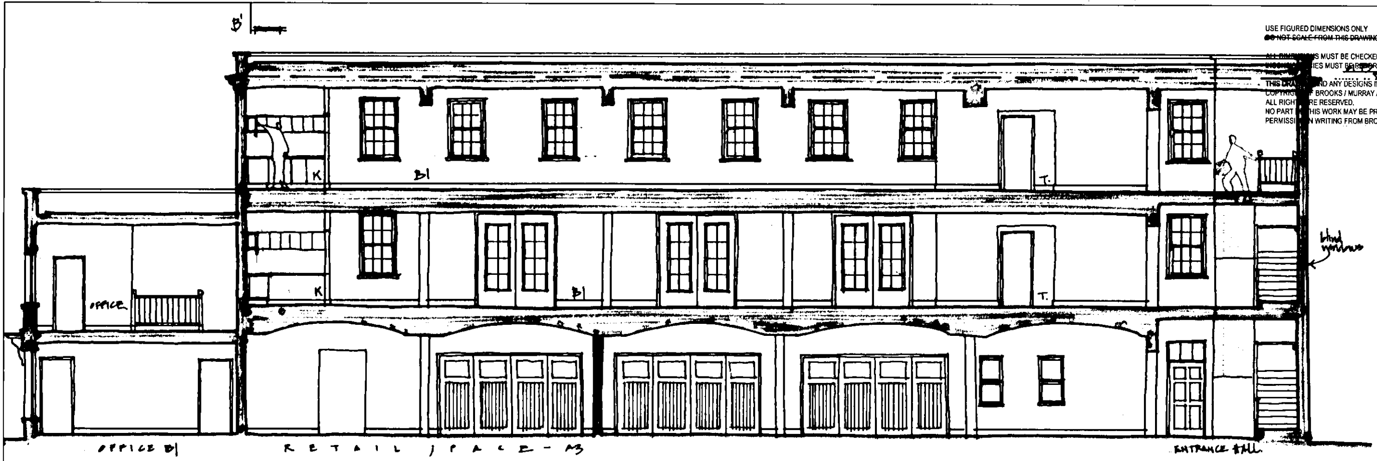
PROPOSED SECTION A-A'

USE FIGURED DIMENSIONS ONLY NOT SCALE FROM THIS DRAWING. ALL DIMENSIONS MUST BE CHECKED ON SITE ANY DISCREPANCIES MUST BE REPORTED BACK TO THE ARCHITECT. THIS DRAWING AND ANY DESIGNS INDICATED THEREON ARE THE PROPERTY OF BROOKS / MURRAY ARCHITECTS. ALL RIGHTS ARE RESERVED. NO PART OF THIS WORK MAY BE PRODUCED WITHOUT PRIOR PERMISSION IN WRITING FROM BROOKS / MURRAY ARCHITECTS.