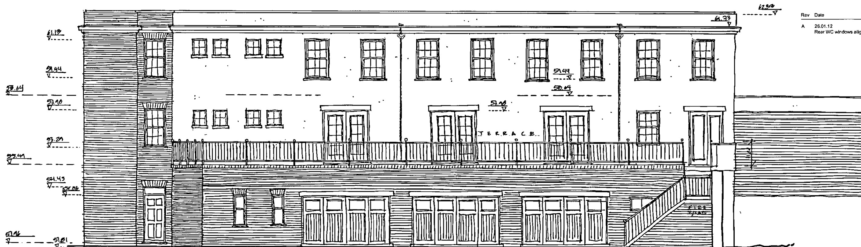
PROPOSED REAR (EAST) ELEVATION

Rev Date A 26.01.12 Rear WC windows aligned