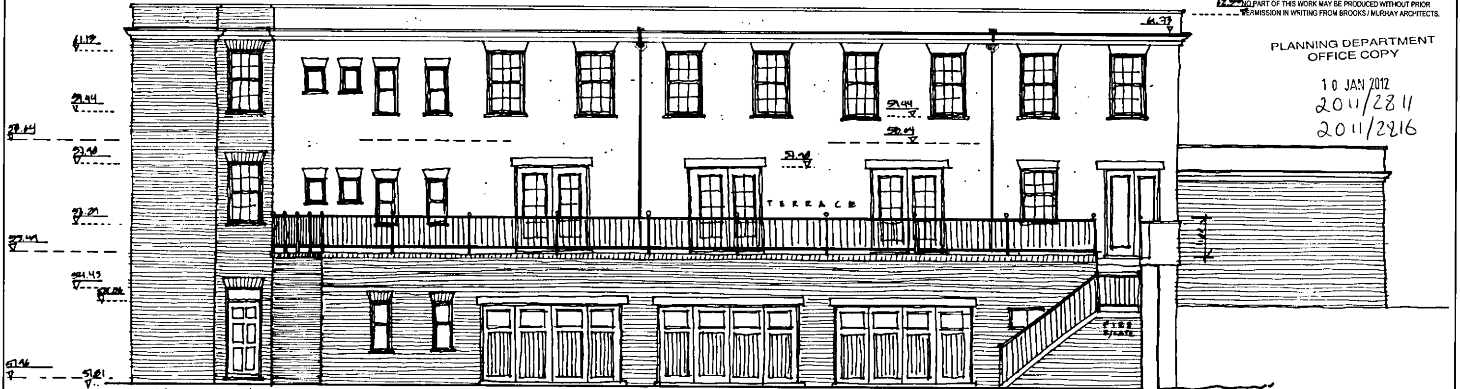
PROPOSED REAR (EAST) ELEVATION