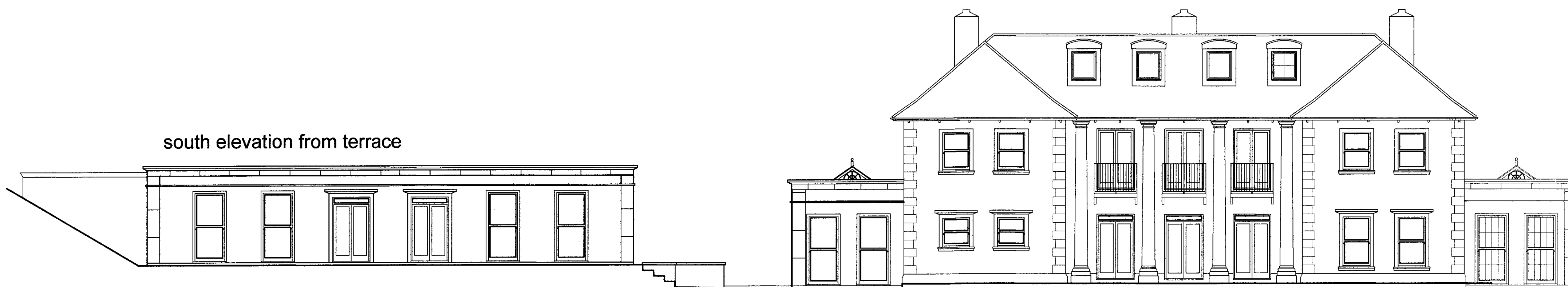
south elevation from terrace