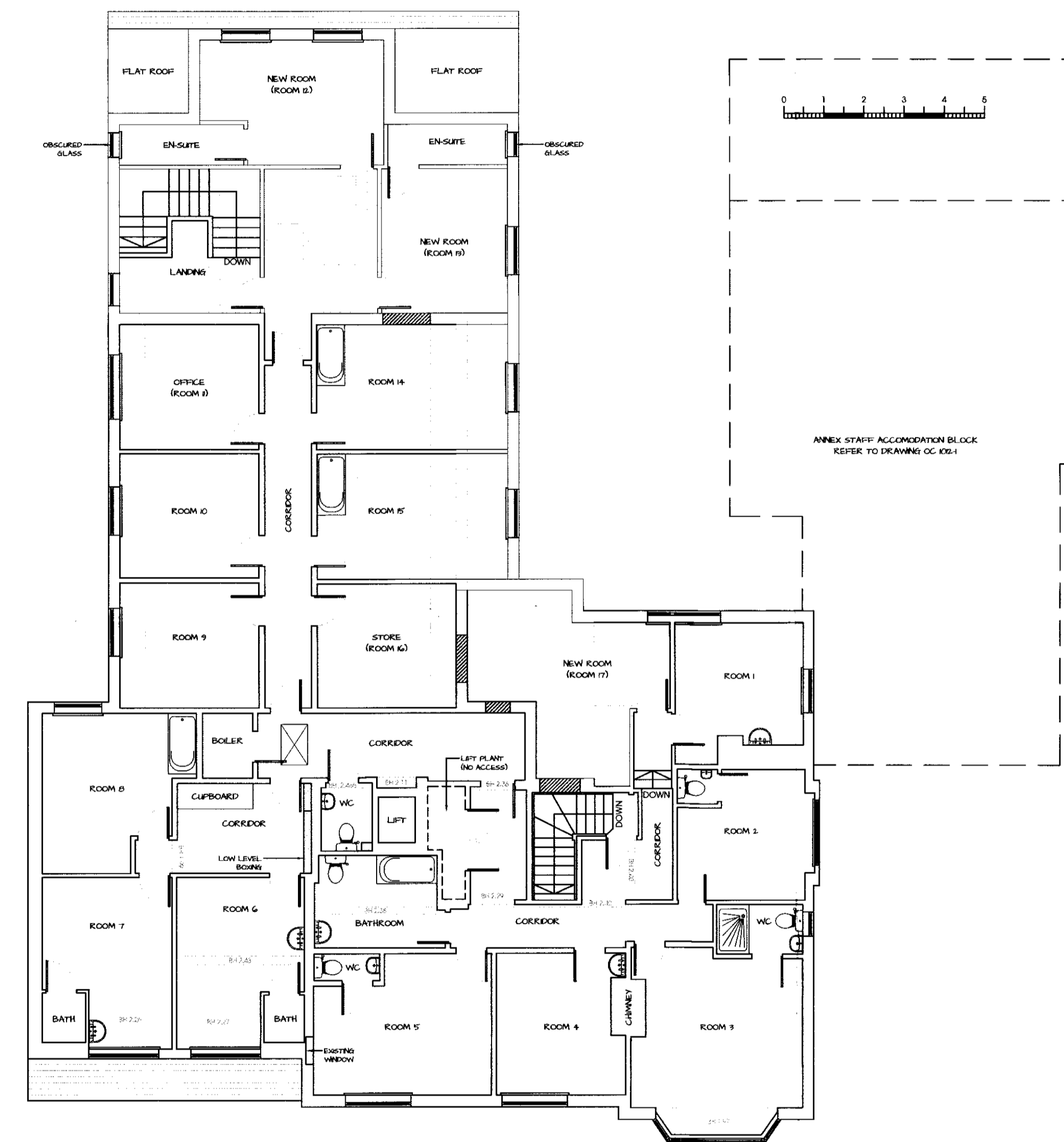
Proposed First Floor