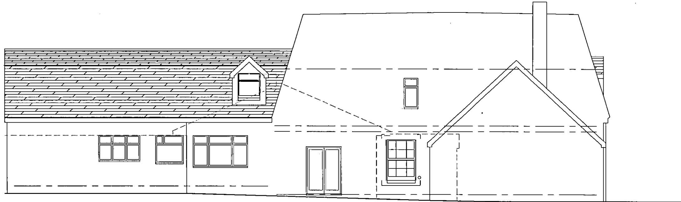
SIDE ELEVATION FROM No 10

NOTE ALL PROPOSED CONSTRUCTION MATERIALS TO MATCH EXISTING