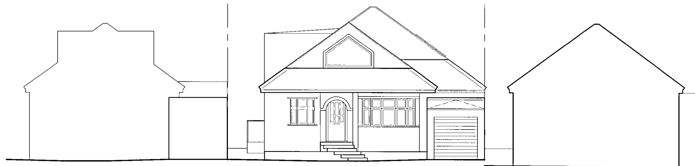
FRONT ELEVATION A-A (SOUTHEAST)

All dimensions to be checked on site prior to construction. © 2011 YOOP Architects Ltd. This drawing is copyright YOOP Architects.