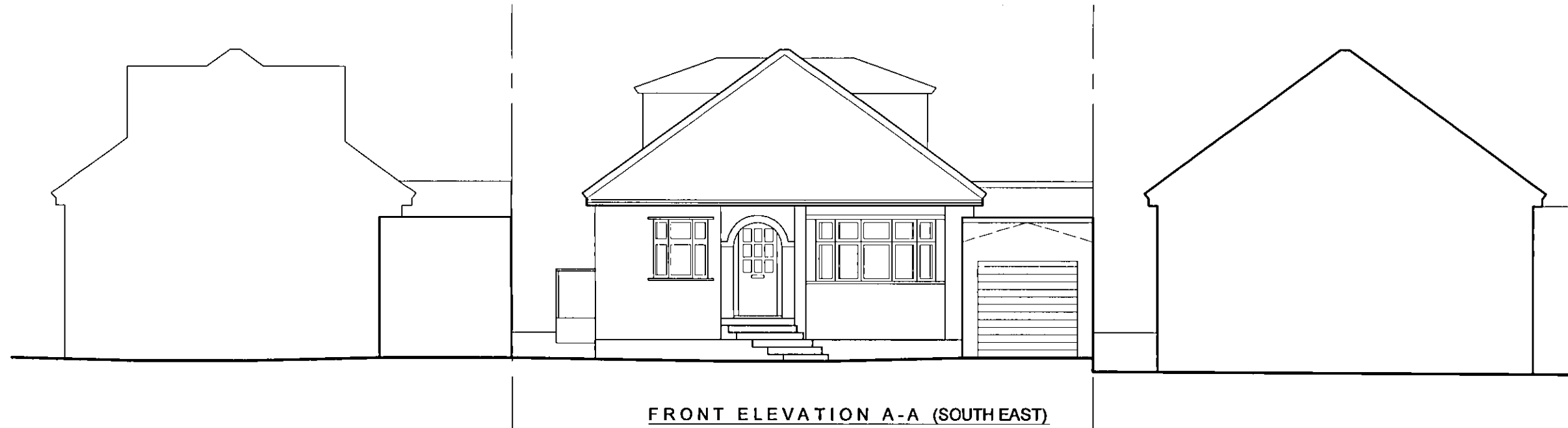
FRONT ELEVATION A-A (SOUTHEAST)

All dimensions to be checked on site prior to construction. This drawing is copyright YOOP Architects.