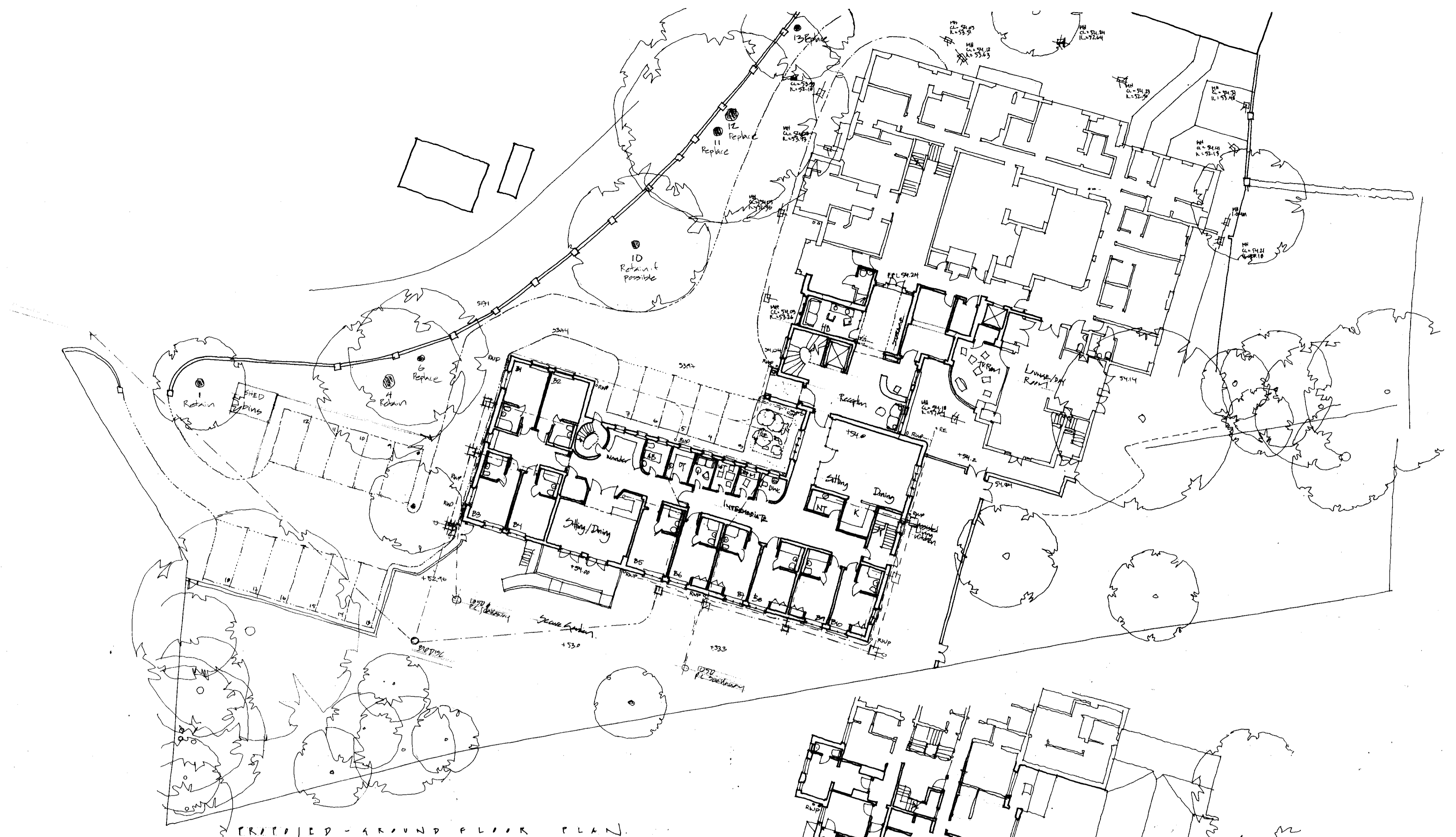
PROPOSED - GROUND FLOOR PLAN.

USE FIGURED DIMENSIONS ONLY. ALL DIMENSIONS MUST BE CHECKED ON SITE. ANY INCONSISTENCIES MUST BE REPORTED BACK TO THE ARCHITECT. THE DRAWING AND ANY DESIGNS INDICATED THEREON ARE THE COPYRIGHT OF BROOKS / MURRAY ARCHITECTS. ALL RIGHTS ARE RESERVED. NO PART OF THE WORK MAY BE PRODUCED WITHOUT PRIOR PERMISSION IN WRITING FROM BROOKS / MURRAY ARCHITECTS.