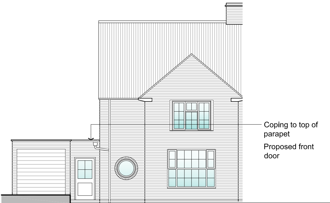
Proposed west elevation