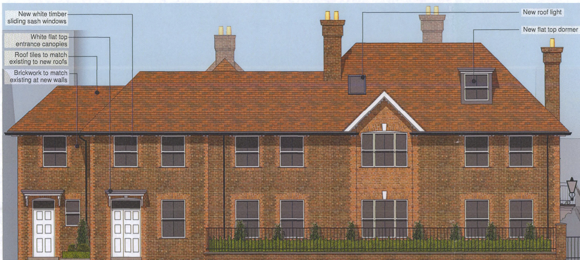
PROPOSED FRONT (SOUTH) ELEVATION