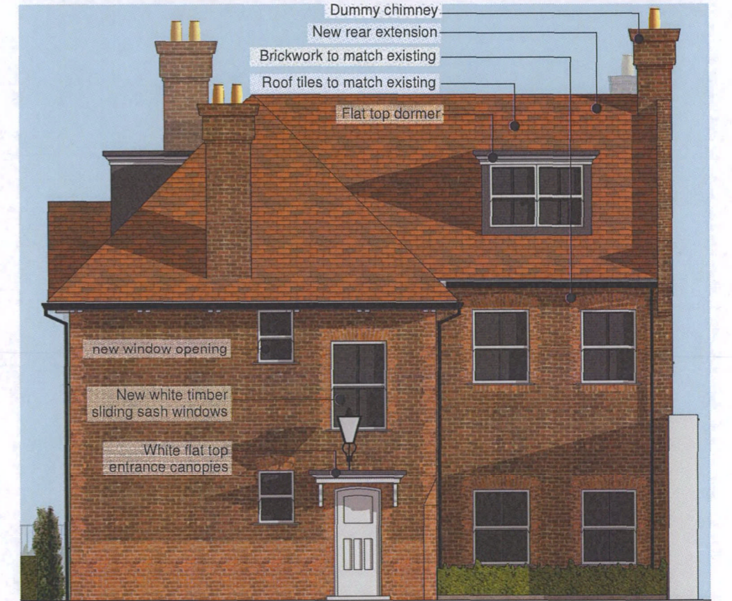
PROPOSED SIDE (EAST) ELEVATION