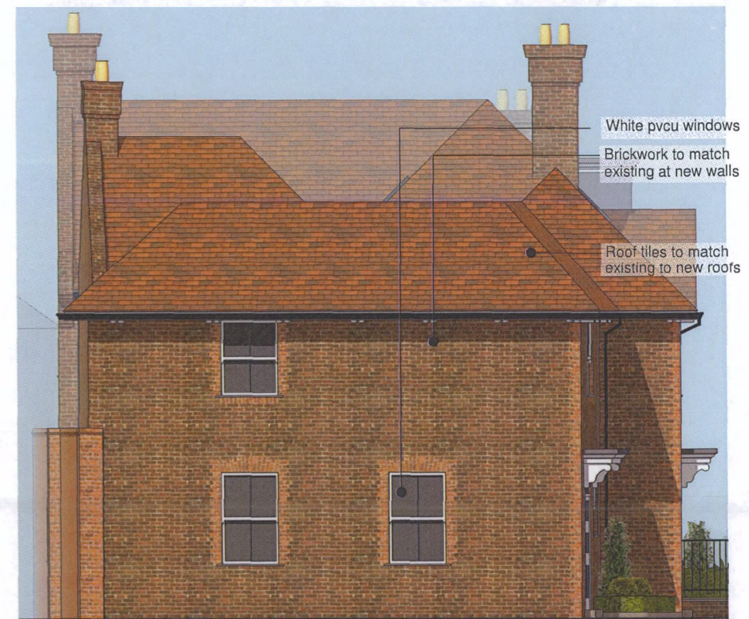
PROPOSED SIDE (WEST) ELEVATION