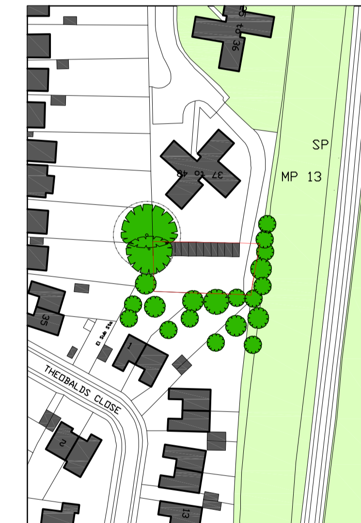
1:1250 SITE LOCATION PLAN

CDM CONSTRUCTION (DESIGN AND MANAGEMENT) REGULATIONS 2007 Designers Hazard Information for Construction These notes refer specifically to the information shown on this drawing. Refer to Health & Safety Plan for further information.