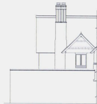
PROPOSED SIDE ELEVATION (B)