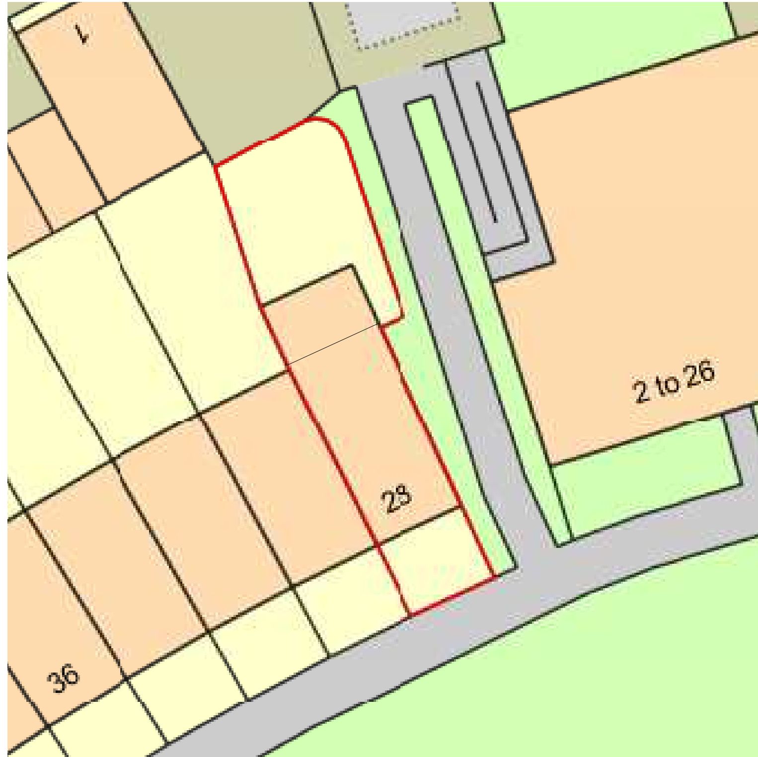
BLOCK PLAN Scale : 1:200