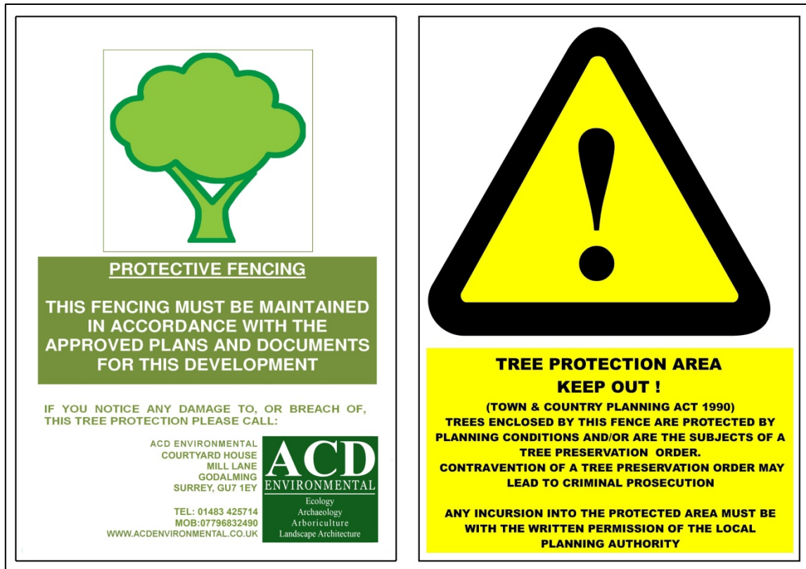
Figure 1: Tree Protection Sign (digital copies available for download at: www.acdarb.co.uk )