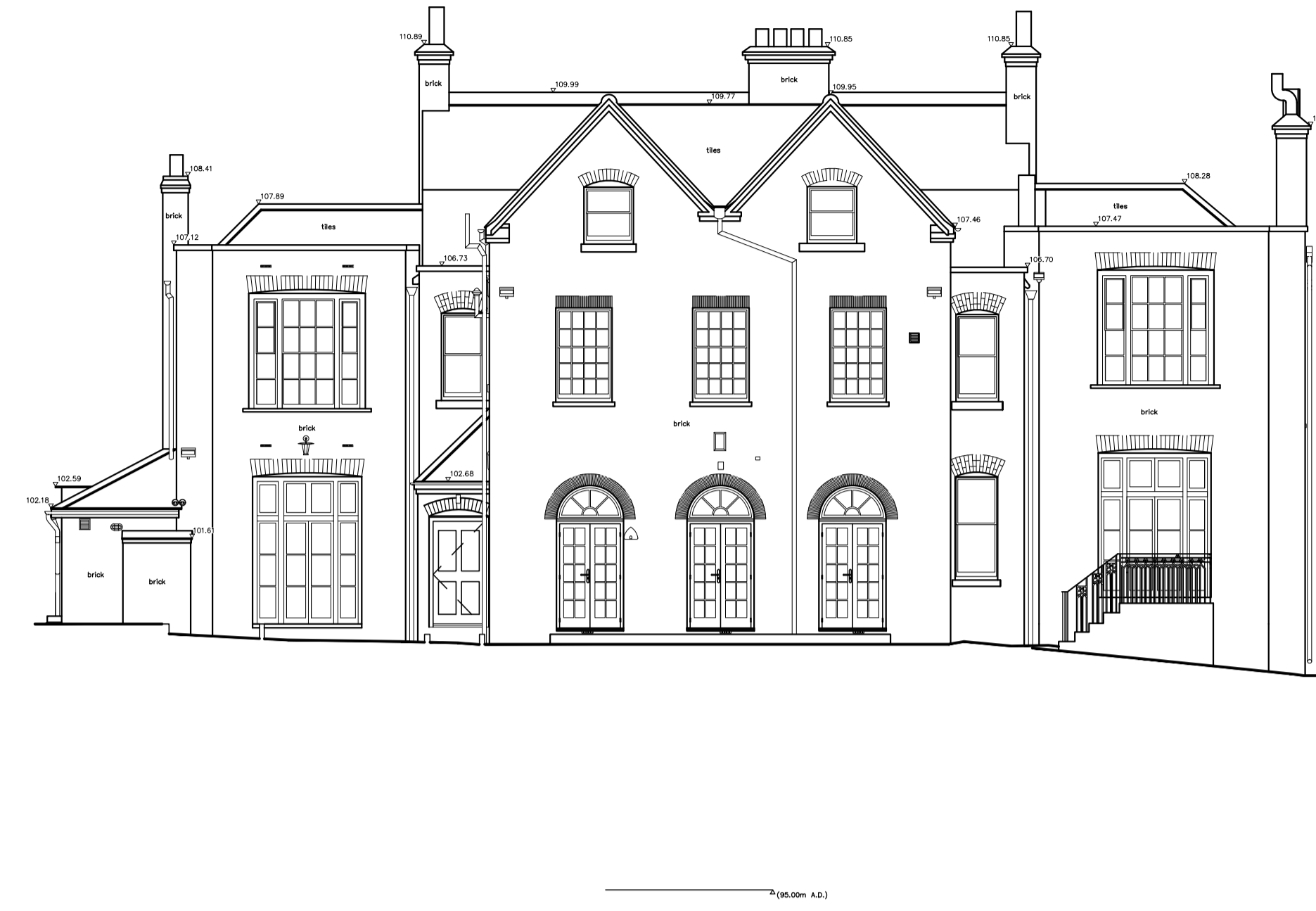
02 Rear Elevation (S/E) 1:100