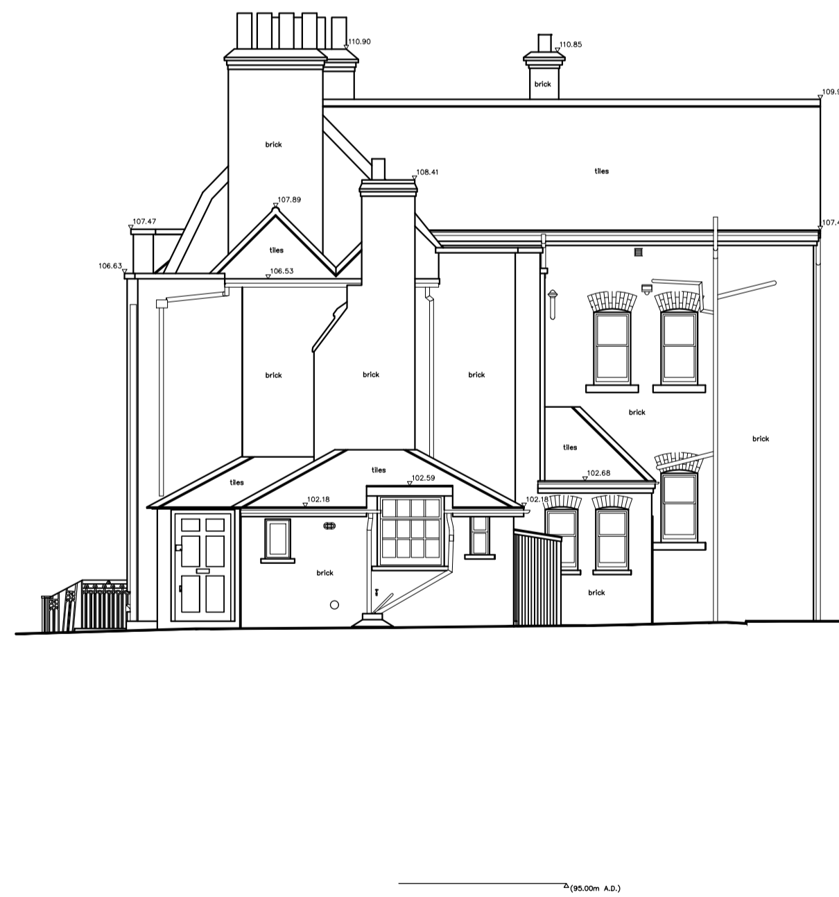
03 Side Elevation (S/W) 1:100