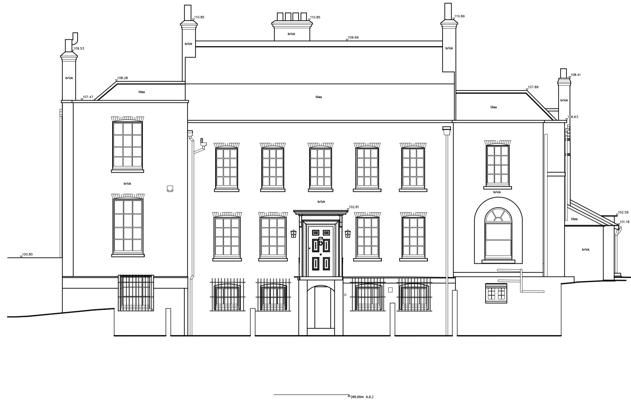
01 Front Elevation (N/W) 1:100