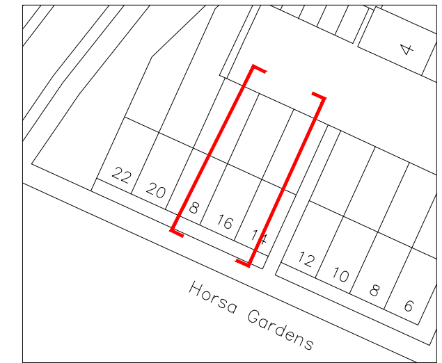
LOCATION PLAN SCALE 1:500