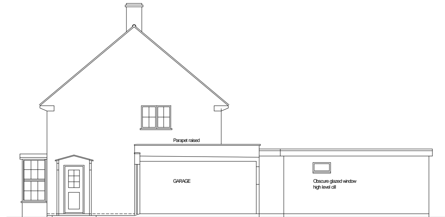
Section through existing garage