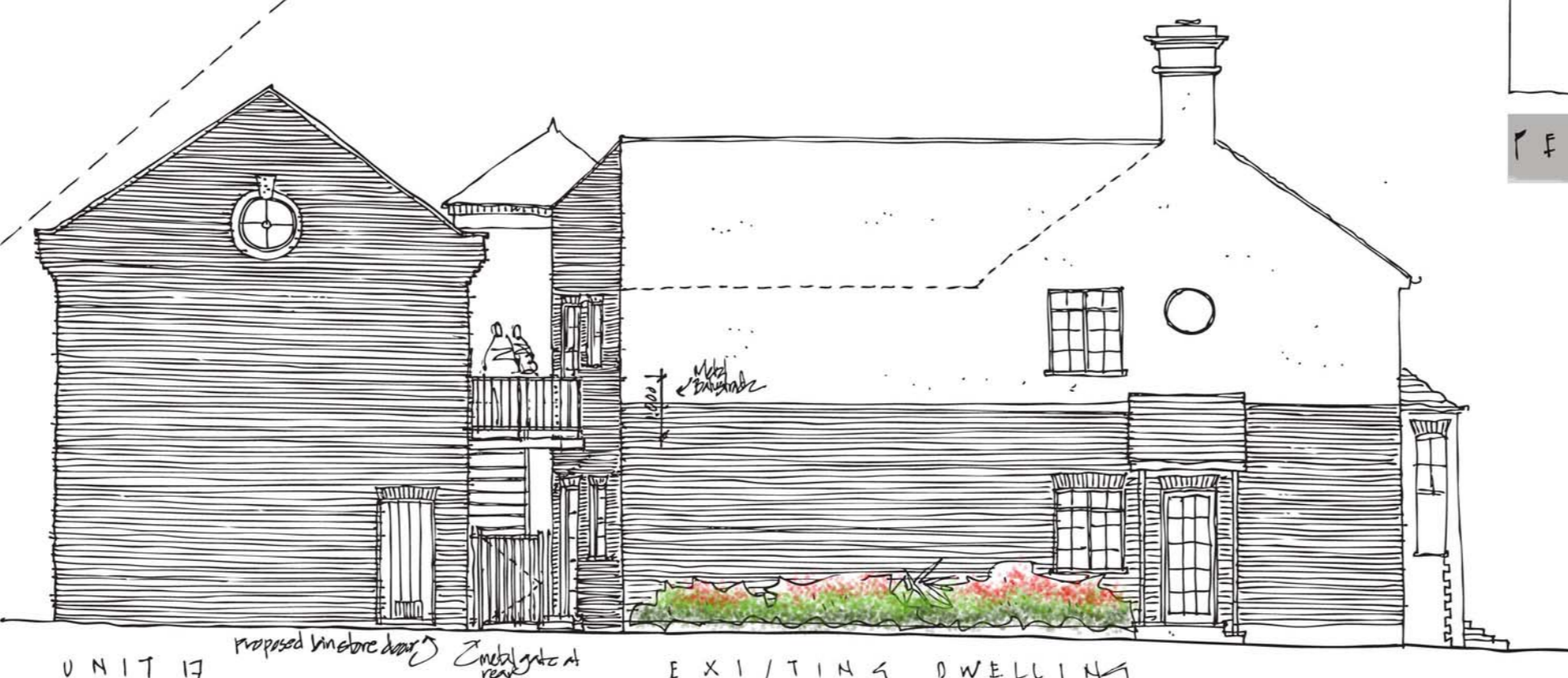
UNIT 17 PROPOSED SOUTH ELEVATION - UNIT 17 1:100

BROOKS / MURRAY ARCHITECTS 8-10 NEW NORTH PLACE LONDON EC2A 4JA TEL 020 7739 9955 FAX 020 7739 9944 architects@brooksmurray.com