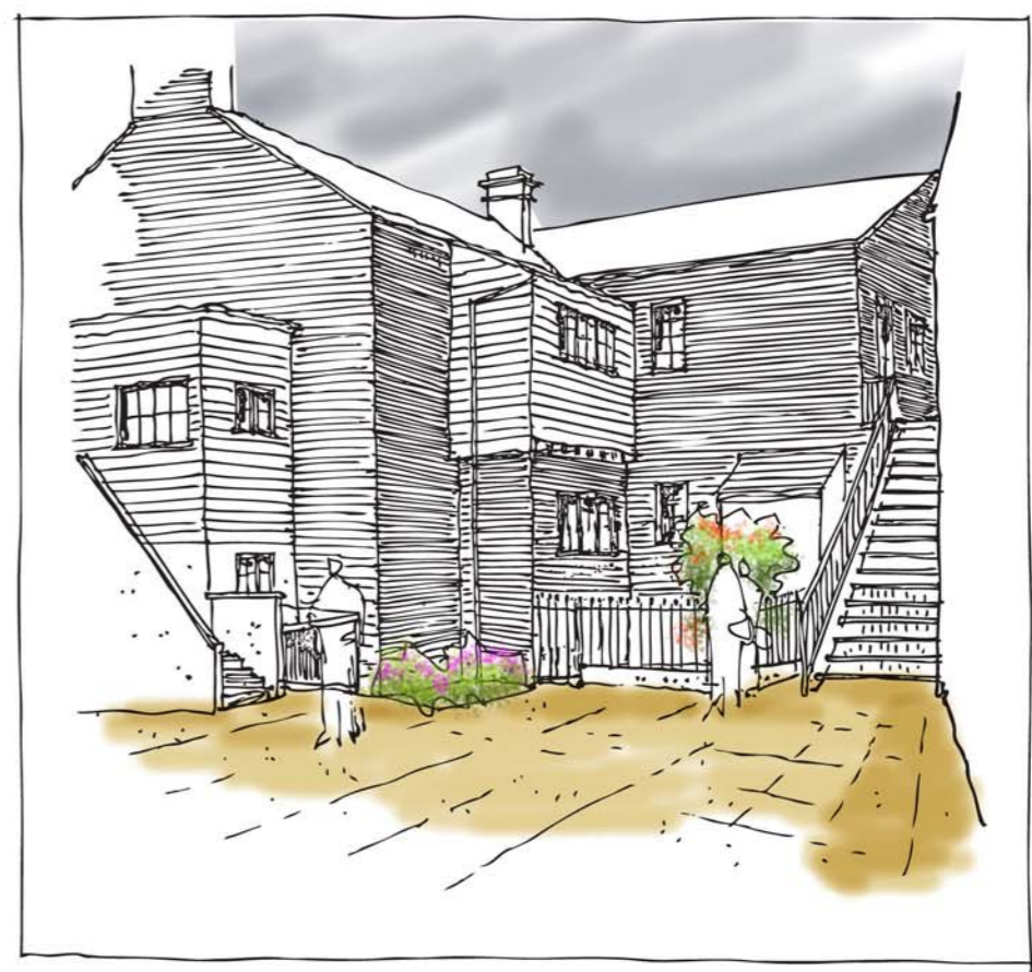
PERSPECTIVE - FRM. COURTYARD