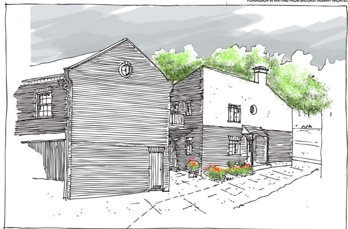
PERSPECTIVE - FRM. ALLEY