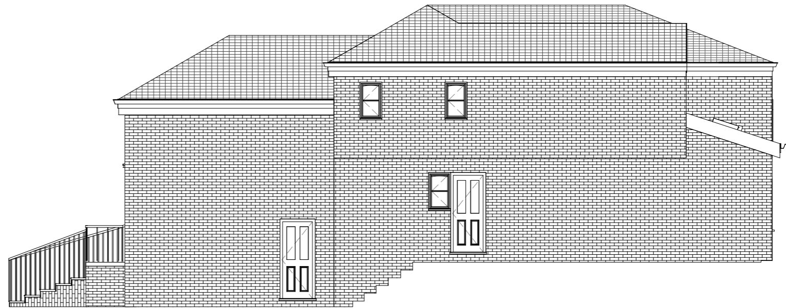
PROPOSED SOUTH ELEVATION 1 : 100