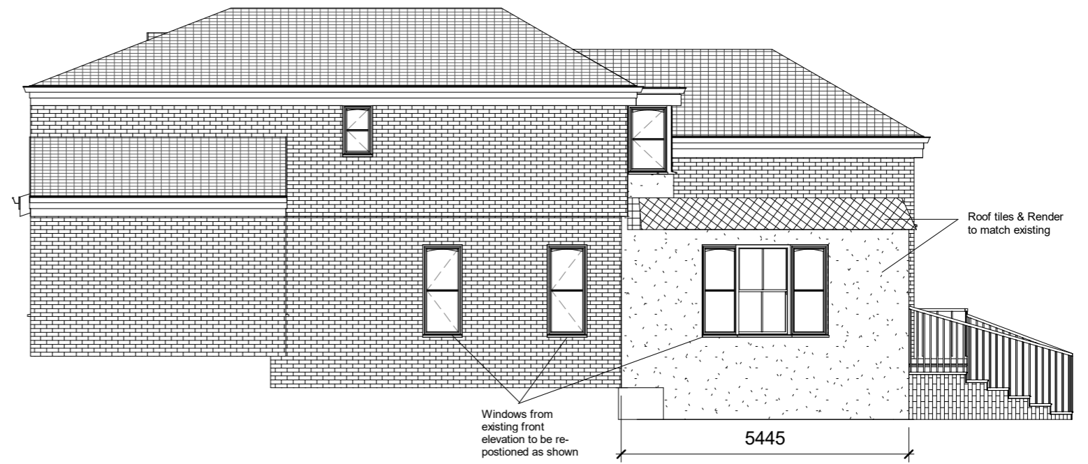
PROPOSED NORTH ELEVATION 1 : 100