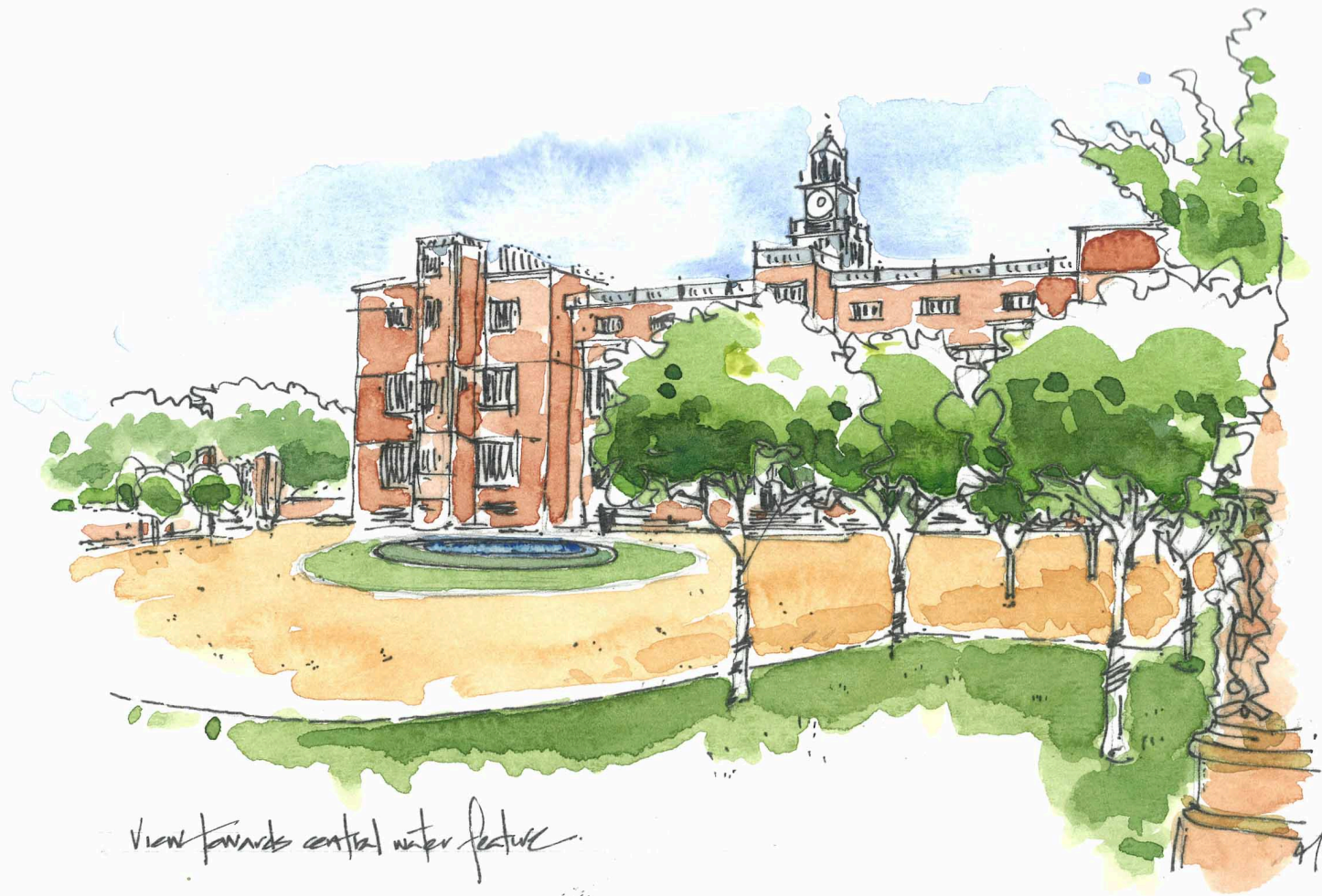
view towards central water feature

THIS DRAWING AND ANY DESIGNS INDICATED THEREON ARE THE COPYRIGHT OF BROOKS / MURRAY ARCHITECTS. ALL RIGHTS ARE RESERVED. NO PART OF THIS WORK MAY BE REPRODUCED WITHOUT PRIOR PERMISSION IN WRITING FROM BROOKS / MURRAY ARCHITECTS