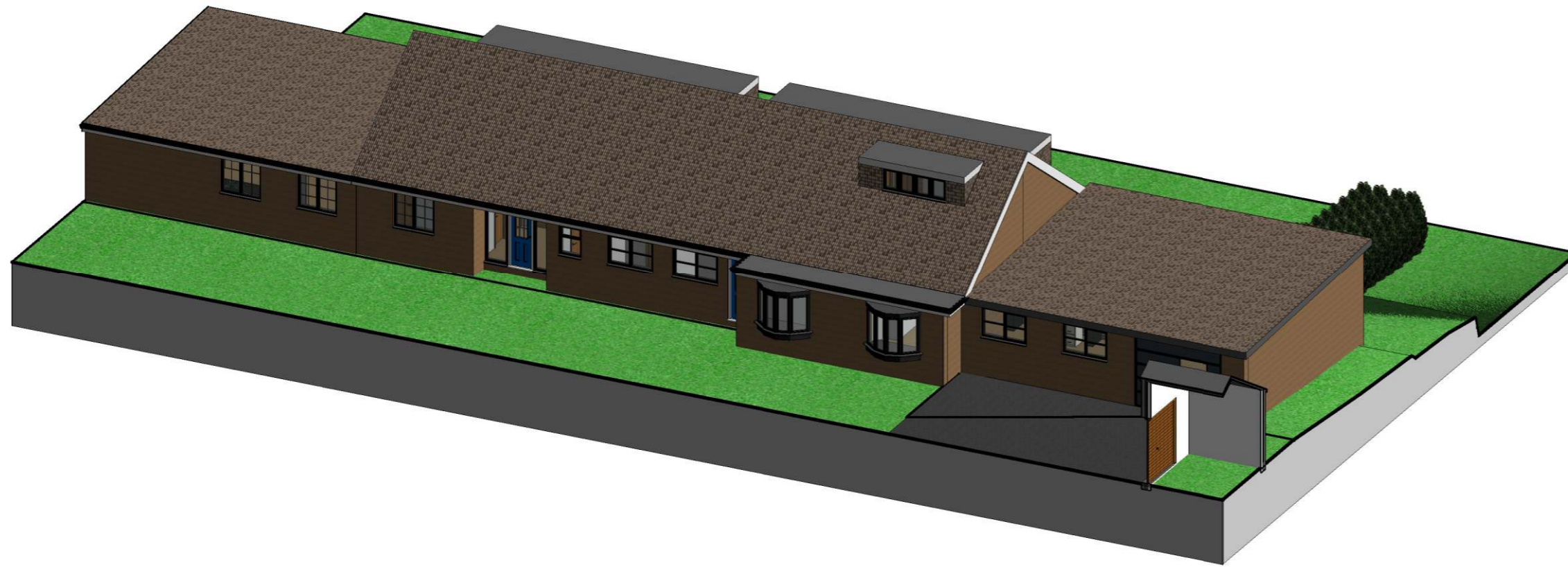
Front 3D View