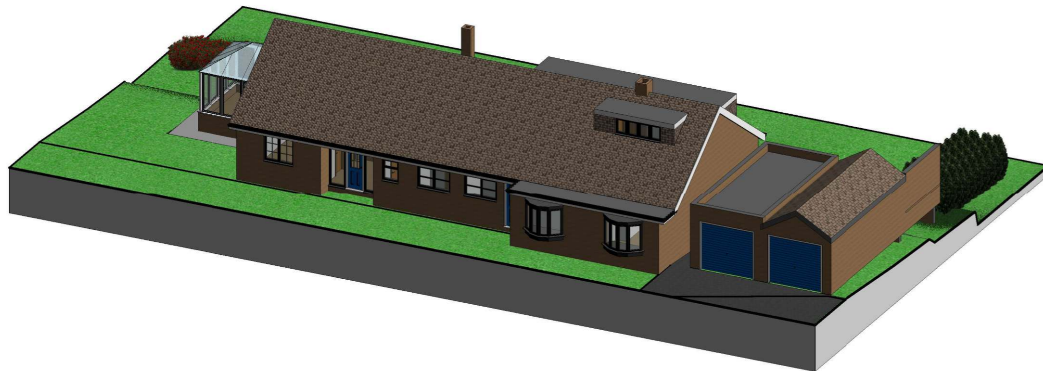
Front 3D View