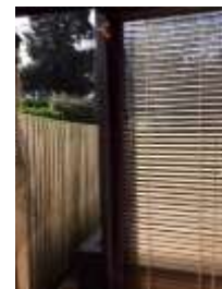
Sun shining into garden before build