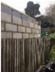
New wall without roof above 6 foot fence reducing natural light We also cannot see past wall From windows and doors