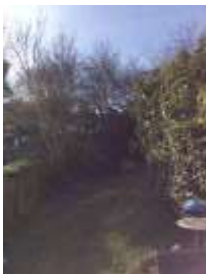
Sun in garden before build started.

Being recessed already between the two neighbours the wall has given a feel of