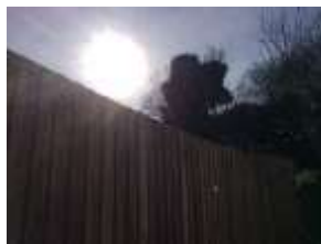
Sun shining from east into the garden before build