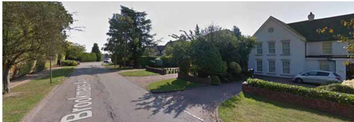
Figure 2: View along Brookmans Avenue facing east towards the site