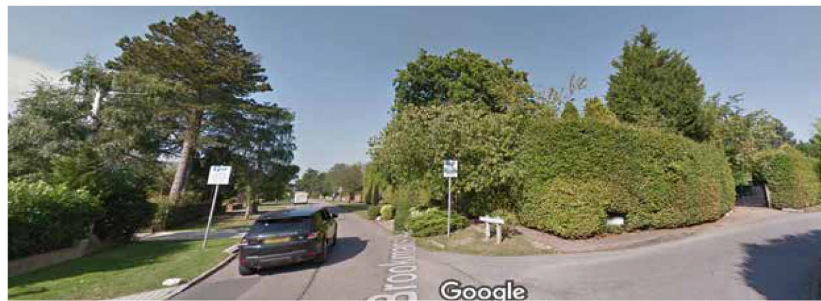
Figure 1: View towards the Brookmans Avenue site boundary

The plot is situated on the corner of Brookmans Avenue and Golf Club Road. It currently consists of a large property and outbuildings set within gardens. The site is screened by a tall beech hedge along Brookmans Avenue and part along Golf Club Road (refer to Figure 1), but then changes to a coniferous hedge in the north east corner. The site is situated on the edge of the urban environment, consisting of managed open space to the north and east in the form of Brookmans Park Golf Club and Chancellor's school playing fields. To the south and west is estate housing.