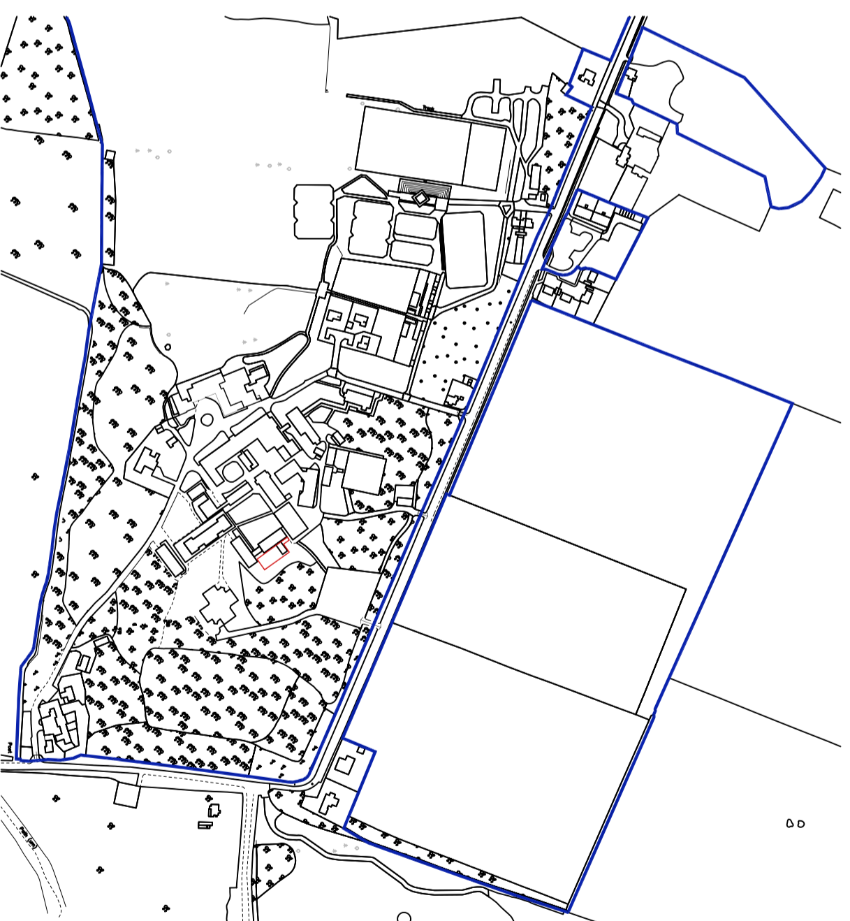
DET 2 LOCATION PLAN SCALE 1:5000 @ A2