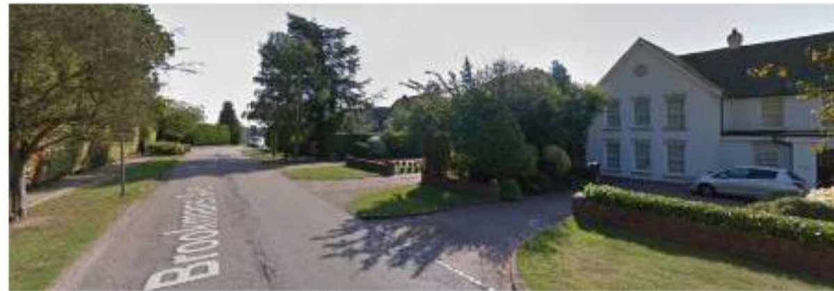
Figure 2: View along Brookmans Avenue facing east towards the site