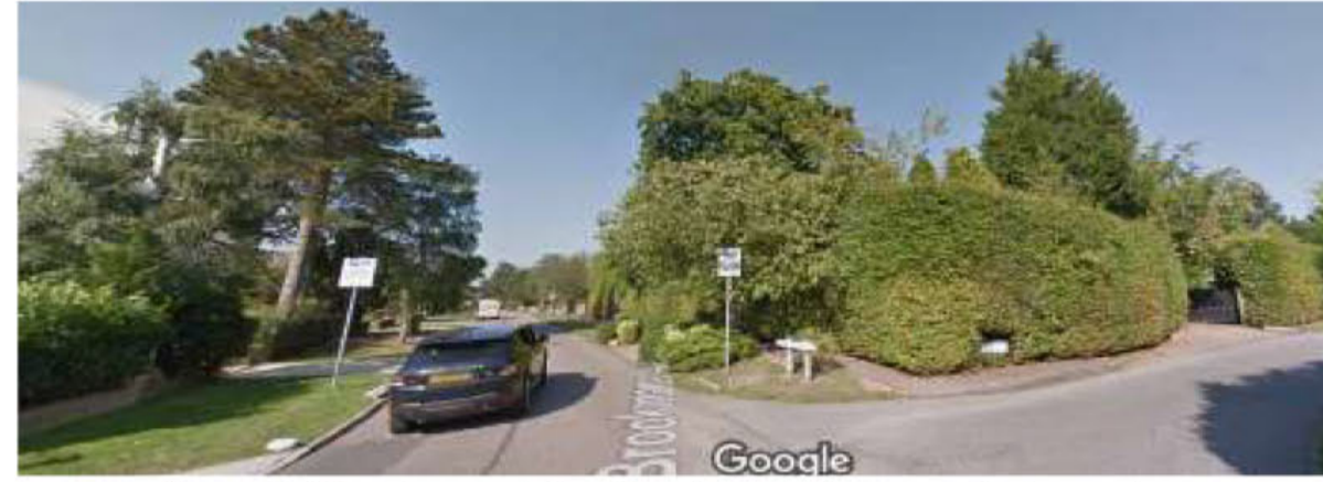
Figure 1: View towards the Brookmans Avenue site boundary

The plot is situated on the corner of Brookmans Avenue and Golf Club Road. It currently consists of a large property and outbuildings set within gardens. The site is screened by a tall beech hedge along Brookmans Avenue and part along Golf Club Road (refer to Figure 1), but then changes to a coniferous hedge in the north east corner. The site is situated on the edge of the urban environment, consisting of managed open space to the north and east in the form of Brookmans Park Golf Club and Chancellor's school playing fields. To the south and west is estate housing.