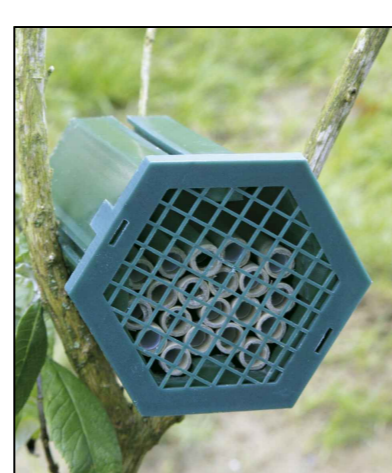
INS-1: Bee Nesting Box (2 No.)