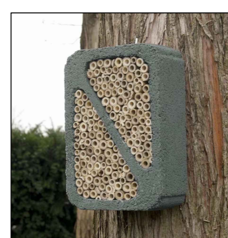
INS-3: Woodstock Insect Block 9x18x26cm (2 No.)