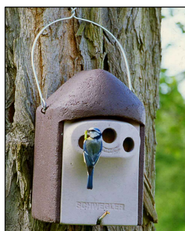
BB1: 2GR Schwegler 3 Hole Nest Box. (2 No.)