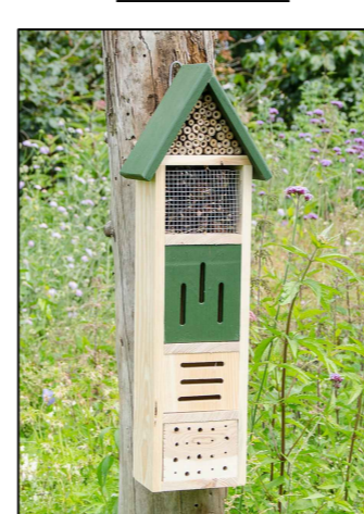
INS-2: Insect Tower 21x65cm (2 No.)