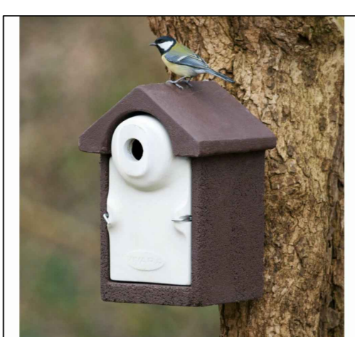
BB2: Vivara Nesting Box 32mm. (2 No.)