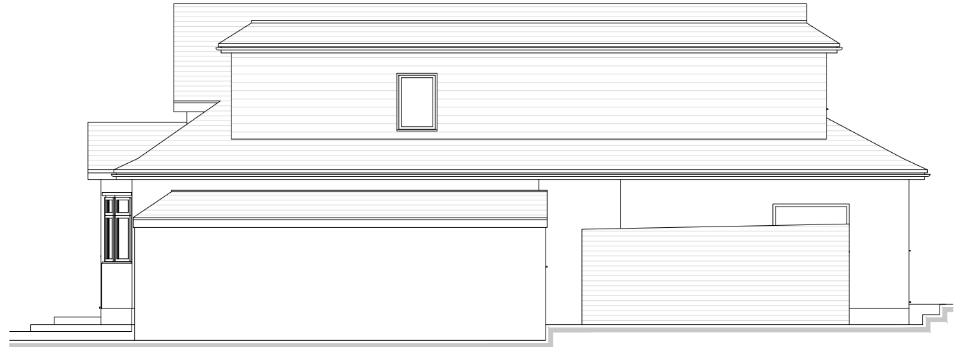
C SIDE ELEVATION EXISTING