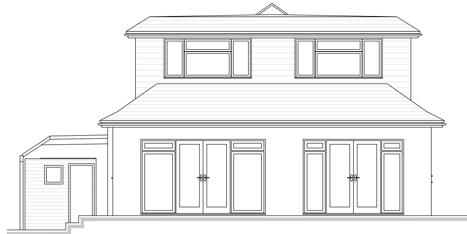
B REAR ELEVATION EXISTING