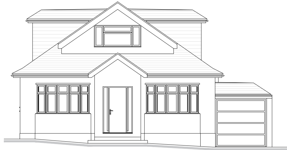
A FRONT ELEVATION EXISTING