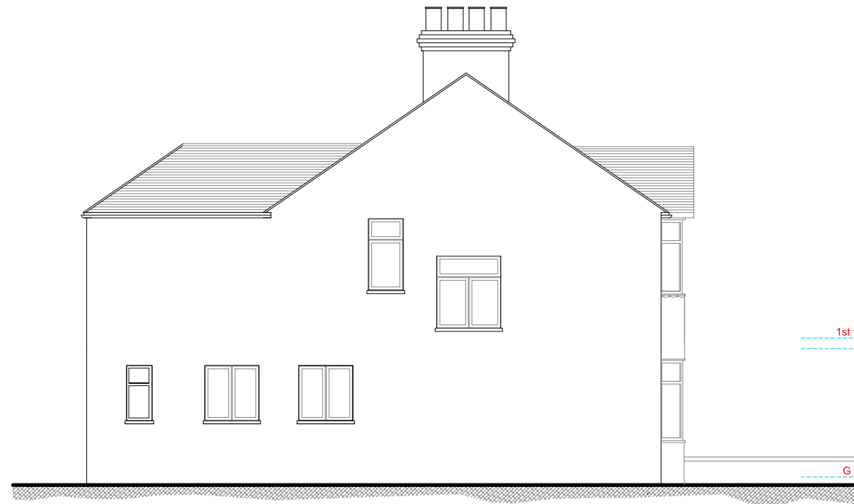
33 Holme Road, Hatfield AL10 9LH EXISTING Elevation BB - Side (South)