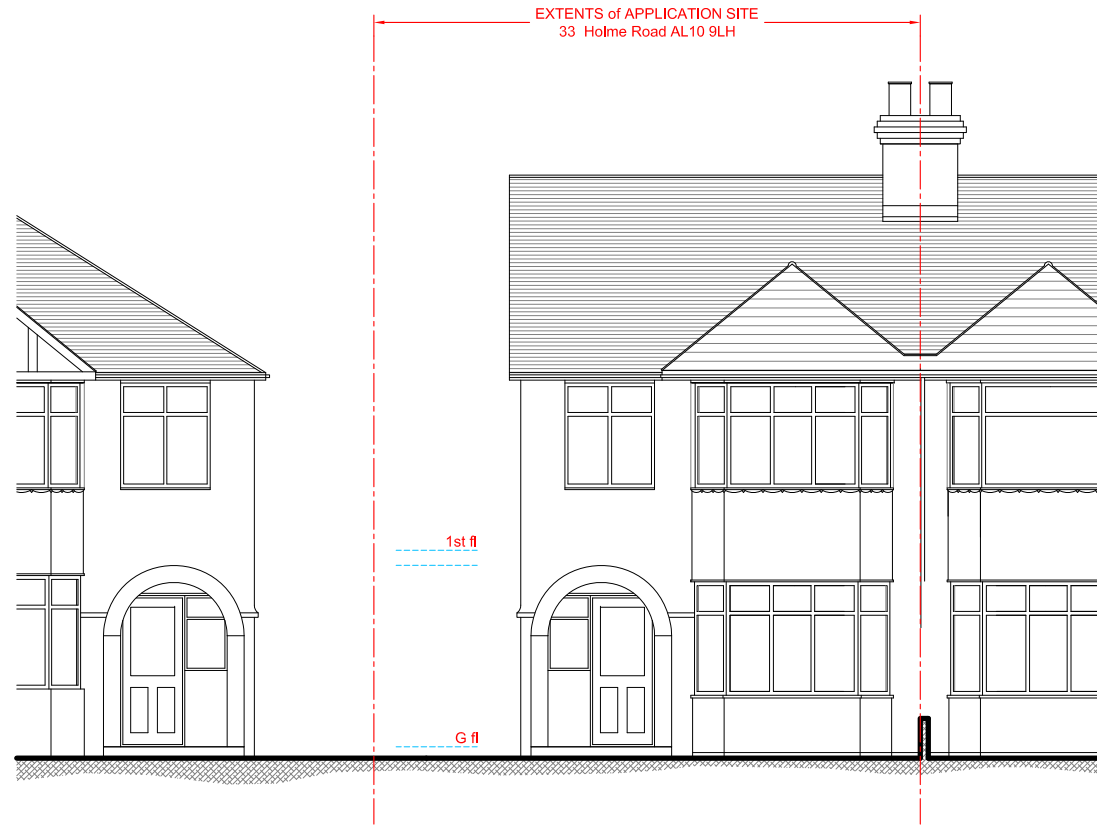
33 Holme Road, Hatfield AL10 9LH EXISTING Elevation AA - Front (West)