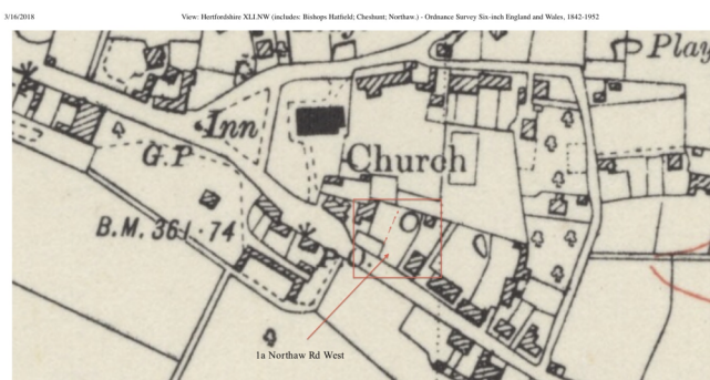
Ref Map 3 1949