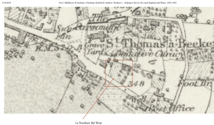
Ref Map 1, 1886

The damaged portion of wall and the remaining brick retaining section of the boundary, both from construction style materials and archive research, would appear to be linked solely with the more recent erection of number 1a Northaw Road West and be of no historical value or interest.